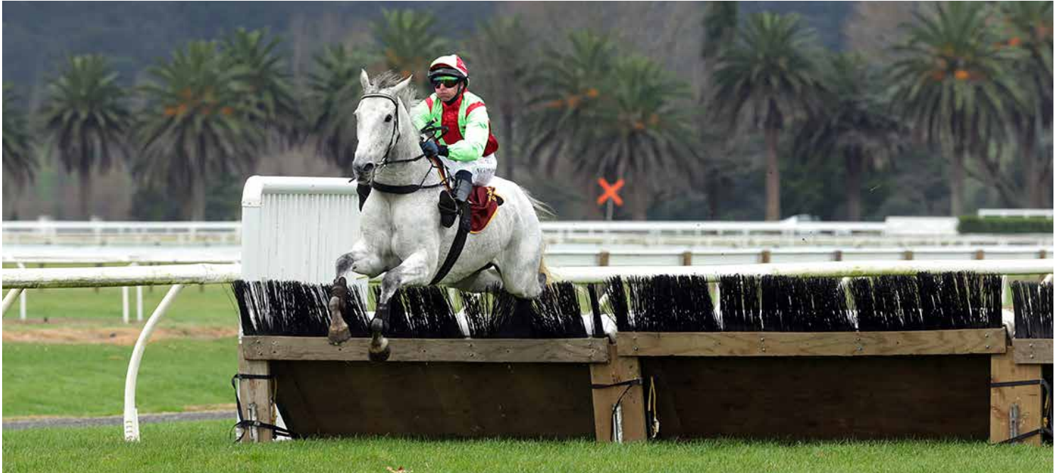
Helena Baby on his way to winning at Te Aroha on Monday.

Quality flat performer Helena Baby (NZ) (Guillotine) added a second string to an already impressive bow as he cruised to a debut victory over fences when taking out the TAJC Hospitality Hurdle (3100m) at Te Aroha on Monday with consummate ease.