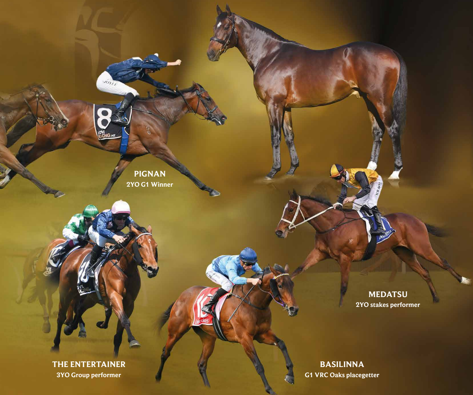
PIGNAN 2YO G1 Winner

ONE OF NEW ZEALAND'S MOST EXCITING YOUNG SIRES WITH MULTIPLE STAKES HORSES FROM HIS FIRST CROP