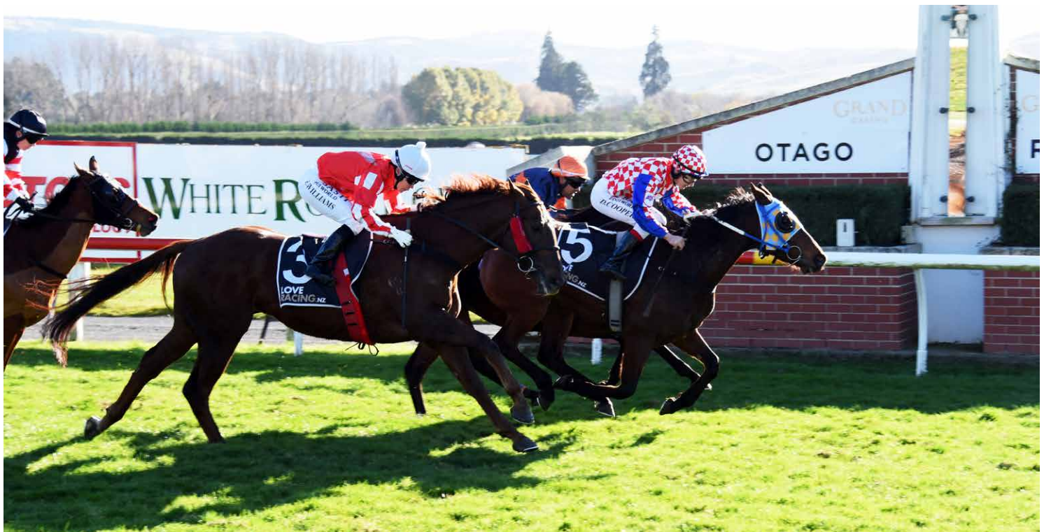
Lofty's Gift holds off the late chargers to win her fourth straight at Wingatui on Sunday.