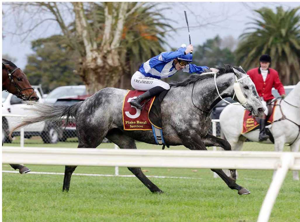
Hula Beat winning at Te Aroha on Monday.