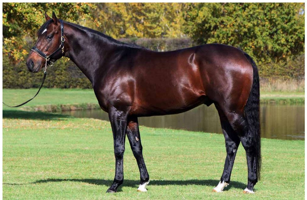
War Decree, sire of Queensland Derby hero Warmonger, stands at $7,000+GST at Inglewood Stud

"His impact on New Zealand thoroughbred breeding shouldn't be overlooked as those mares he imported will have a long-lasting impact on our game and I'm sure the people who were involved with Valachi for all those years will have got just as big a kick out of this victory as we did." – NZ Racing Desk