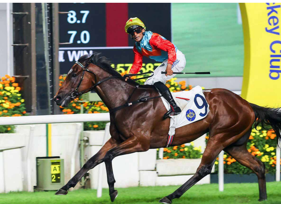
Ka Ying Rising powers to his first Group win.