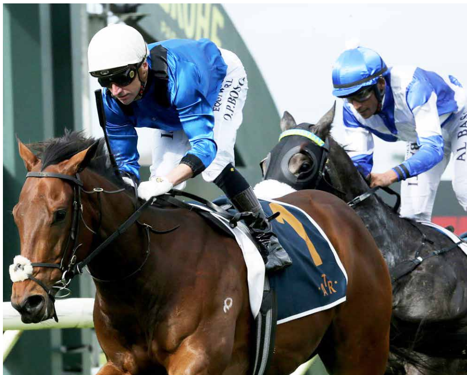
Pokuru Gold storms clear of his rivals to remain unbeaten at Pukekohe on Saturday.