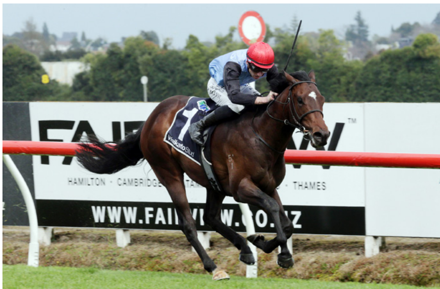
Suit Yourself comfortably winning the Banquo 3yo 1200 at Te Rapa on Saturday.

"He's so much like Savile Row it's not funny. Three or four months after we bought him, he had the same shiny coat and just looked amazing.