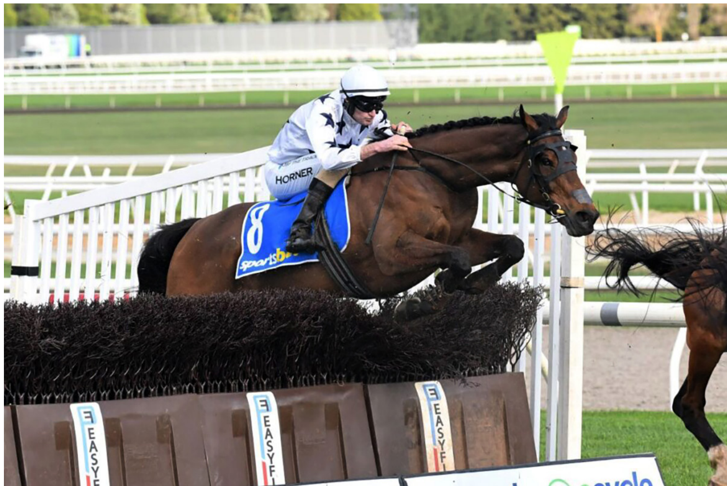
The Good Fight on his way to winning Sunday's A$400,000 Grand National Steeplechase (4500m) at Ballarat.