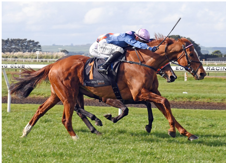
Battle Secret pulls ahead of Wheelitin to win the Norwood 2100 R75 at Hawera on Sunday.