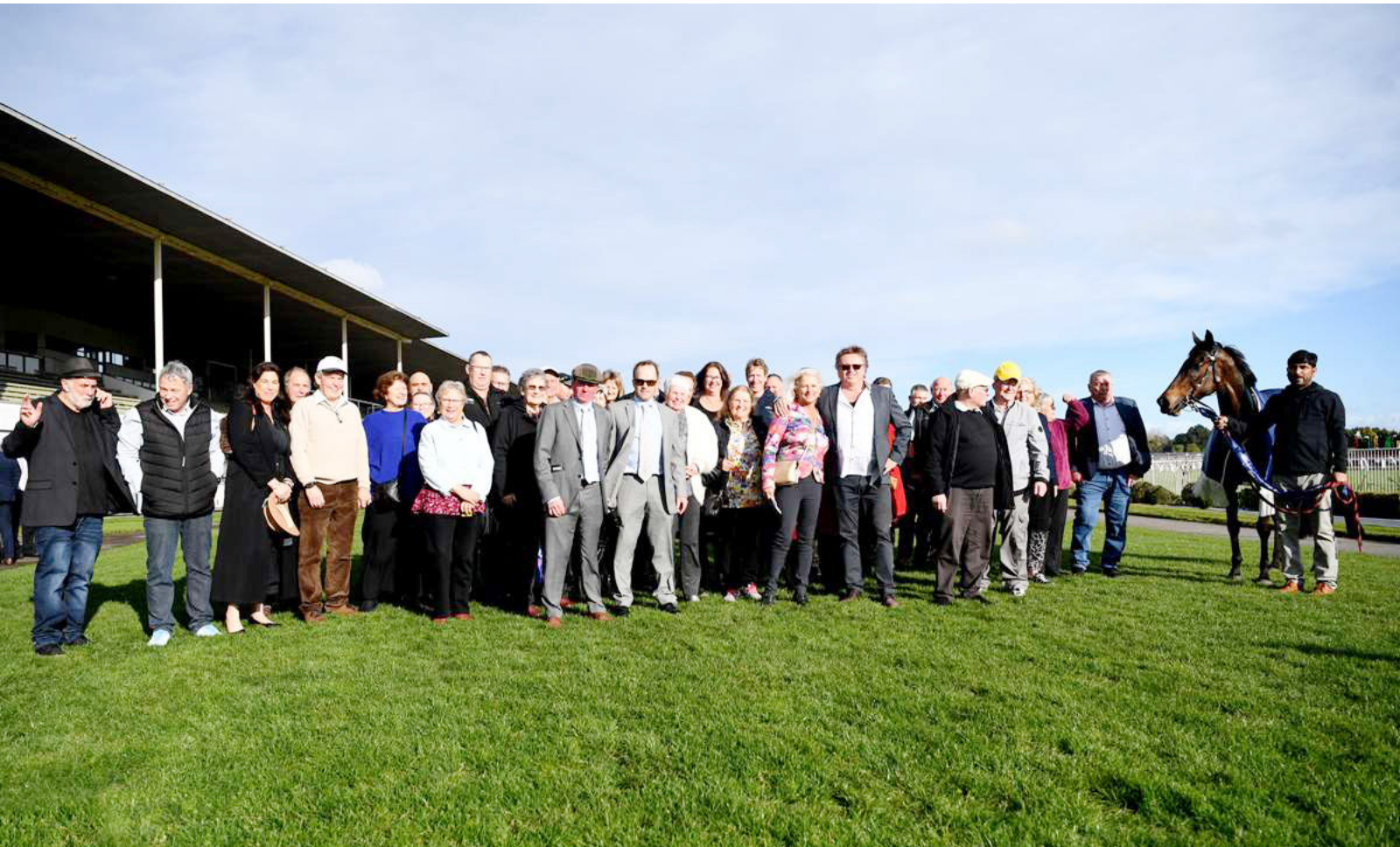
Bonny Lass pictured with the 50-strong Social Racing Starting Gates Syndicate following her win at Te Rapa on Saturday.

The aptly named Bonny Lass (NZ) (Super Easy) is ensuring her sizeable and enthusiastic support crew continue to celebrate the racing and social rewards of affordable thoroughbred ownership.