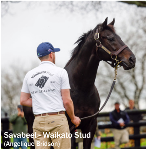
Savabeel - Waikato Stud (Angelique Bridson)