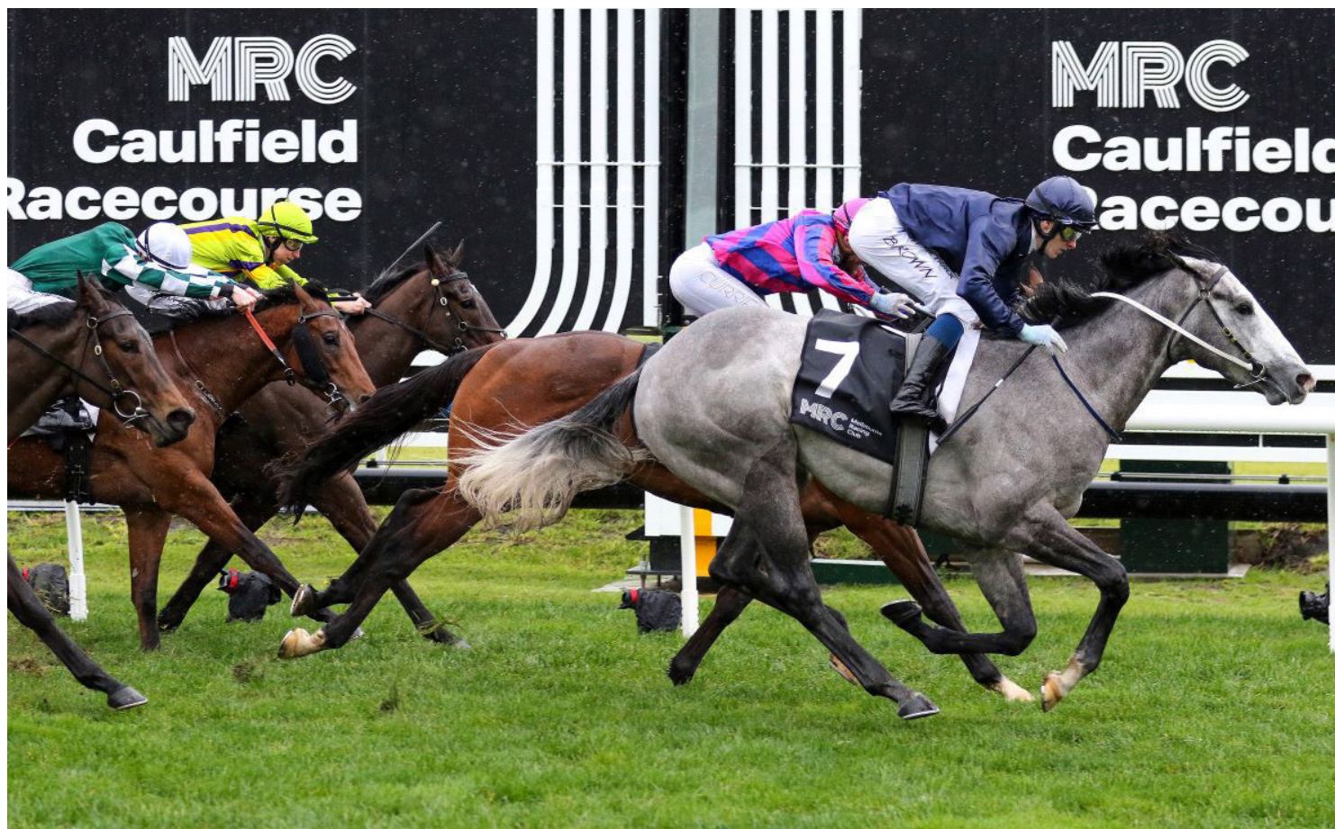
Public Attention winning at Caulfield last month.