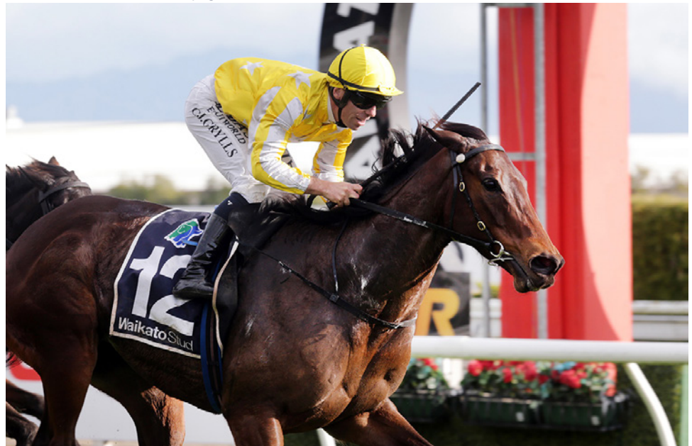
Top mare Bonny Lass returns in winning fashion taking out Saturday's Gr.2 Waikato Stud Foxbridge Plate (1200m) at Te Rapa.

"I developed the concept into a paid model, reduced the numbers to a maximum of 100 people so there was more engagement, and the racing clubs