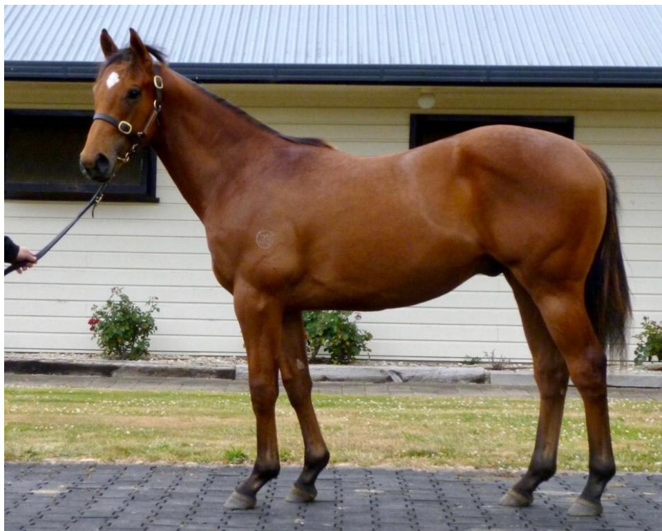
Trigger Pegasus (NZ), pictured as a Karaka 2020 yearling.

Trigger Pegasus has been well-travelled, having started his career with a third and two fourths from three appearances in New Zealand in October and November of 2021. He then travelled to Singapore, where he