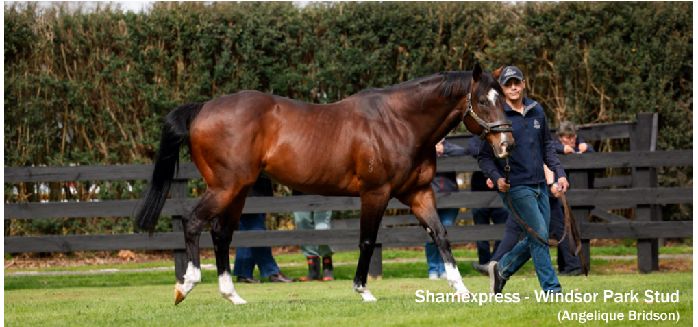
Shamexpress - Windsor Park Stud (Angelique Bridson)