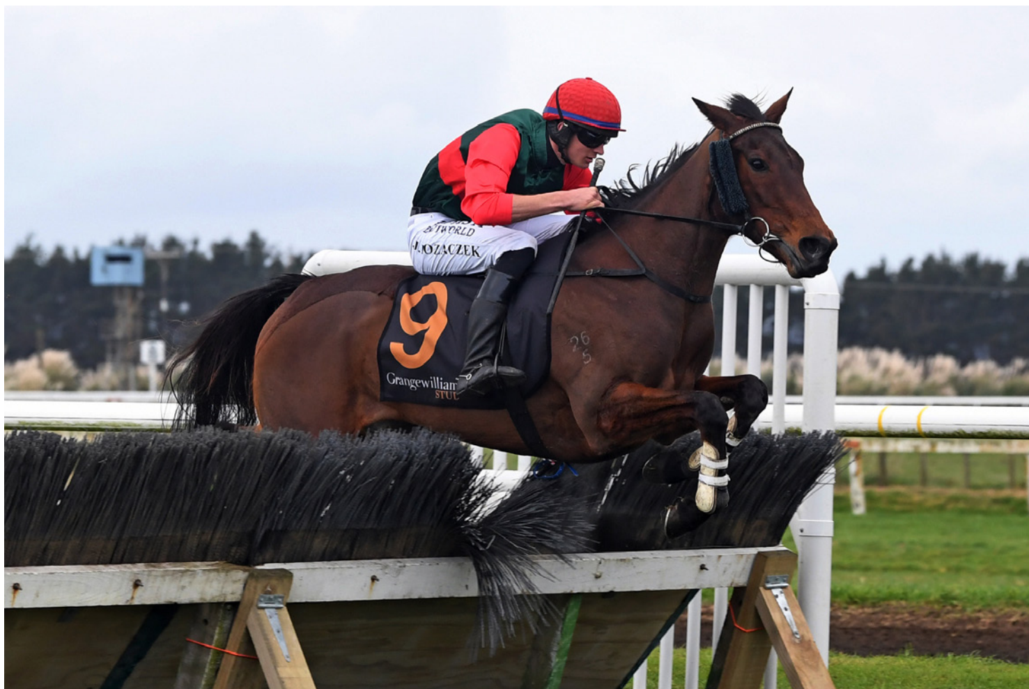
Jakama Krystal on her way to winning the Clayton Yaxley Maiden Steeplechase (3900m) at Hawera on Sunday.