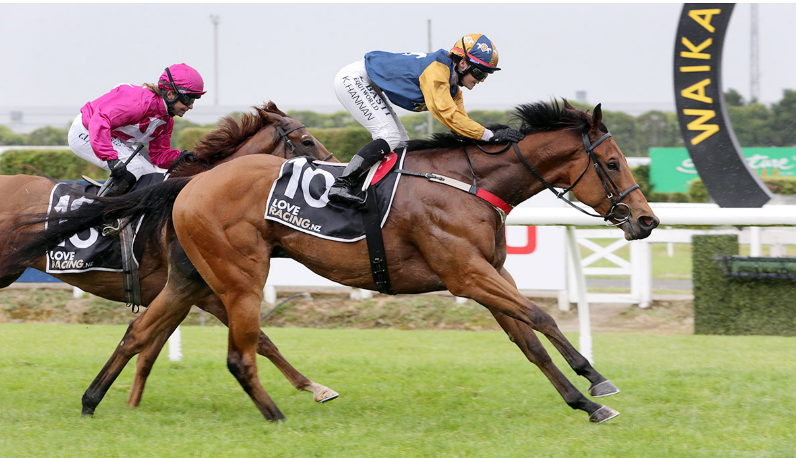
The Racketeer winning at Te Rapa on Saturday.

T he Gr.2 Life Direct Wellington Guineas (1400m) is the likely target for The Racketeer (NZ) (Proisir) after his gutsy victory at Te Rapa on Saturday.