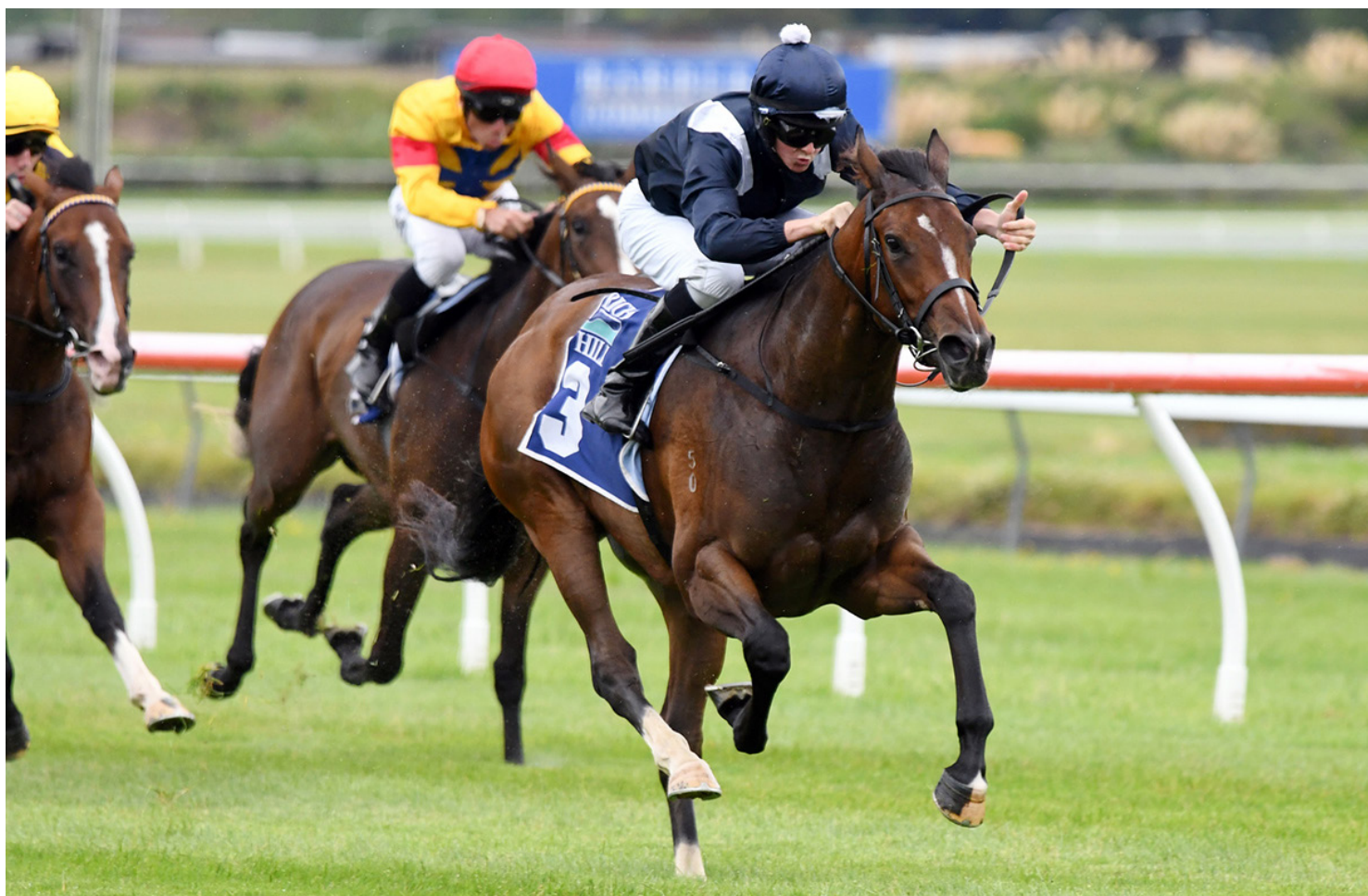
Smart Staphanos two-year-old Pignan winning at Trentham on Saturday