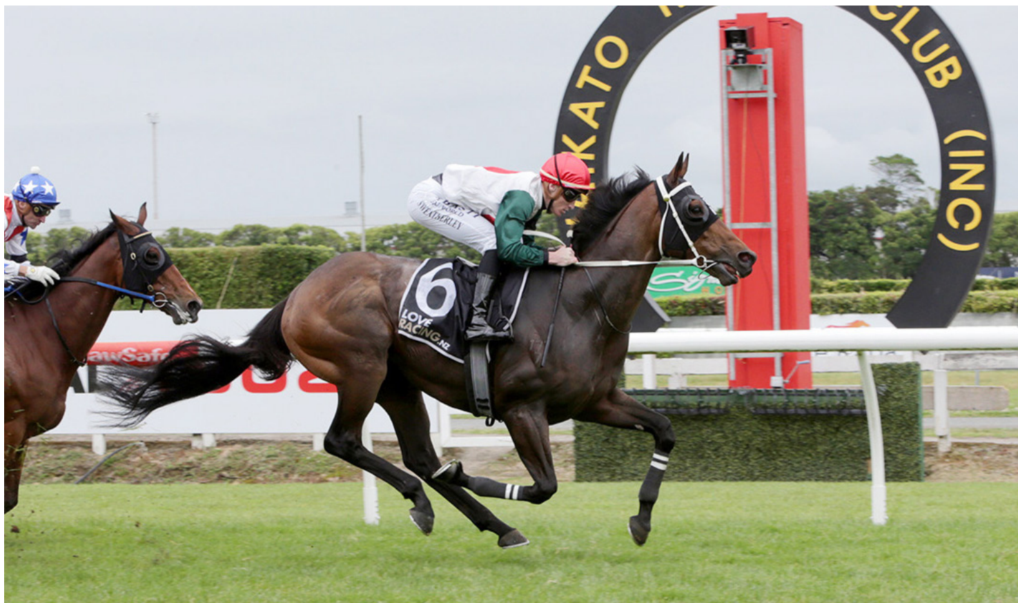
Encierro was a comfortable winner of the Nationwide Livestock Mile (1600m) at Te Rapa on Saturday

A varied training regime is proving the perfect formula for in-form galloper Encierro (NZ) (El Roca) who continued his rich vein of form when successful in the Nationwide Livestock Mile (1600m) at Te Rapa on Saturday.