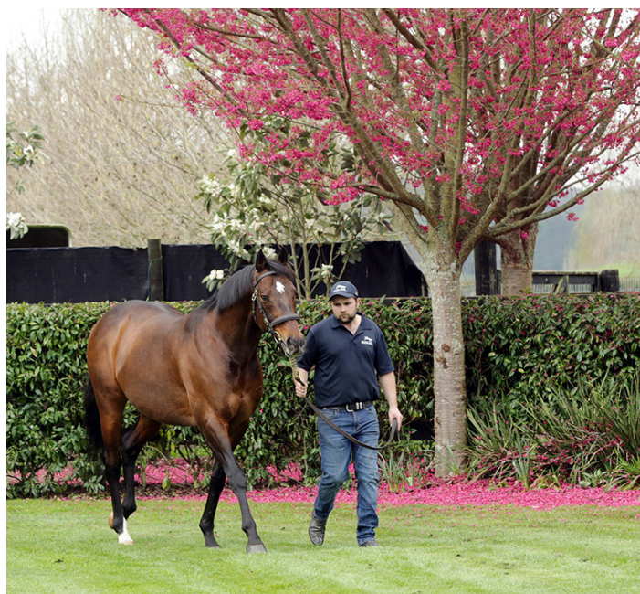
Group One performed son of Deep Impact Staphanos on show at Novara Park

"I've got his dam in foal to Sweynesse again now, and the dam's half-sister is as well, so hopefully there'll be plenty more to come with this family." – NZ Racing Desk