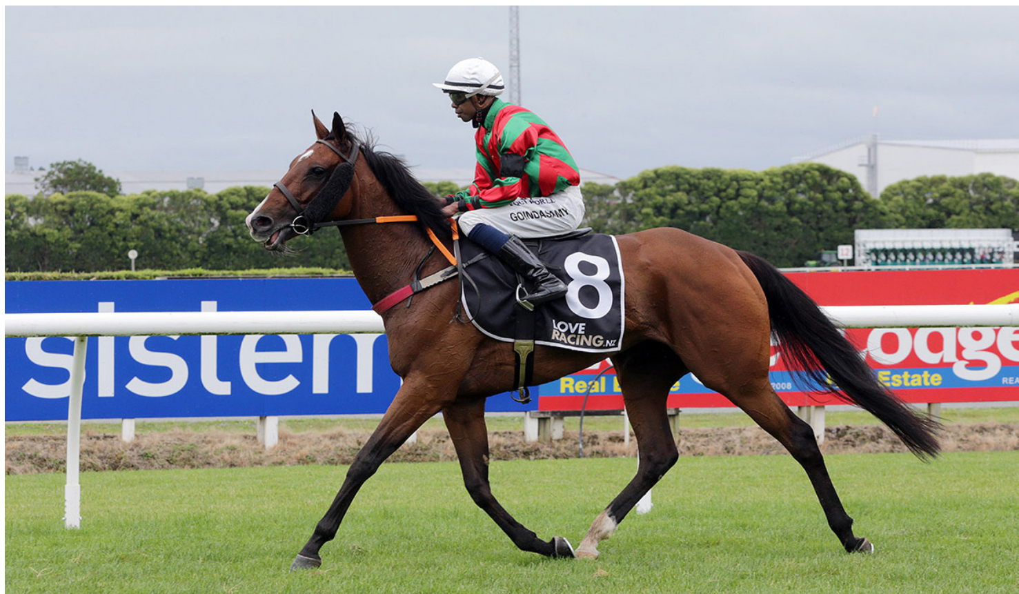
Cups targets await Hinepara after her pleasing run at Te Rapa on Saturday.