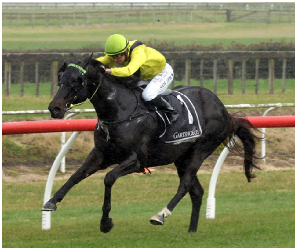
Did The Trick powers away from his rivals to score in Saturday's Gartshore Construction 3YO (1300m) at Tauranga.