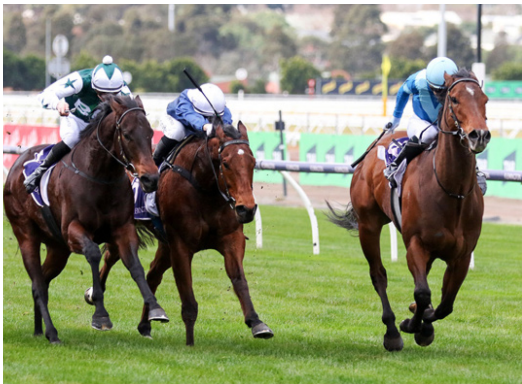
Crosshaven bursts clear of his rivals to win at Flemington.