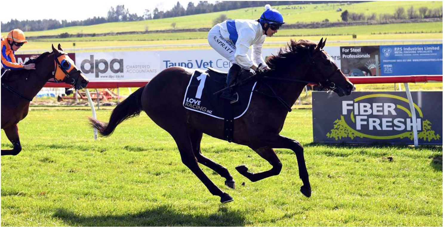
Savaglee winning at Taupo in August.