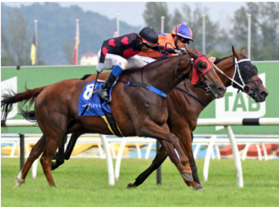
Antipodean (inside) gets his head in front to win the Selangor Gold Cup.