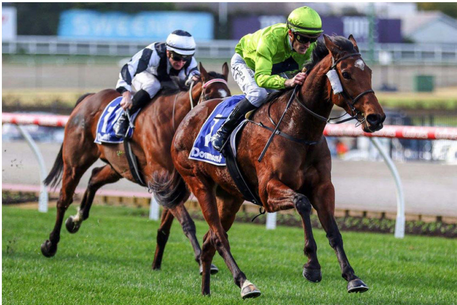
Dashing Duchess cruises to victory at The Valley.