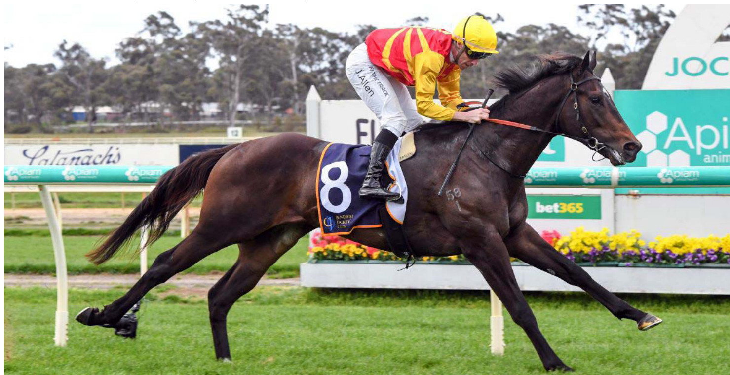
Rue De Royale (NZ) was a comfortable winner at Bendigo on Sunday.