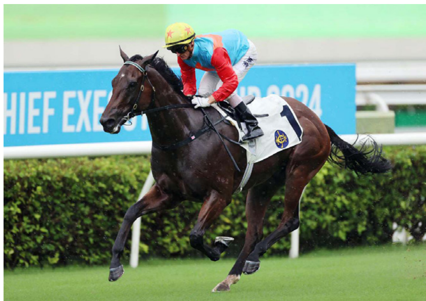
Ka Ying Rising winning at Sha Tin on Sunday.