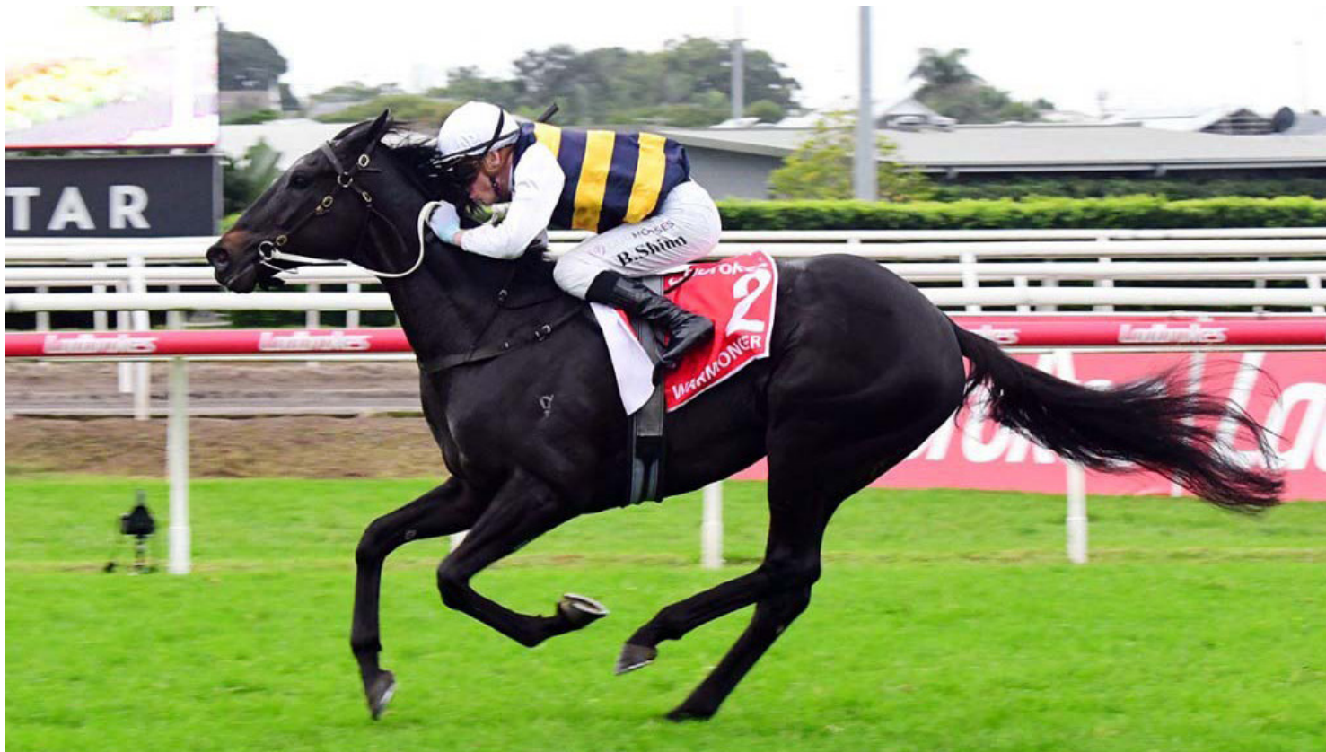
Warmonger winning the Gr.1 Queensland Derby.