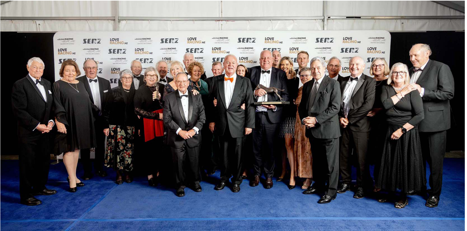
The connections of SENZ Horse of the Year Imperatriz.