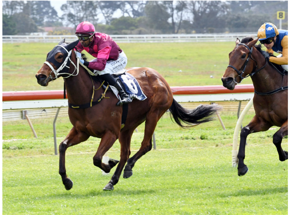
Simsala winning at Ruakaka on Saturday.

"She seems to be turning the corner, I hope.