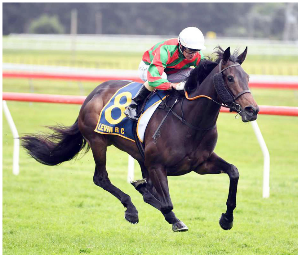
Faraglioni could be in for a big spring following her runner-up effort in Saturday's Gr.1 Tarzino Trophy (1400m).

Shaw is now weighing up Faraglioni's next target, with the Gr.3 Grangewilliam Stud Taranaki Breeders' Stakes (1400m) at Hawera on October 5 and the Gr.1 Arrowfield Stud Plate (1600m) at Hastings later this month