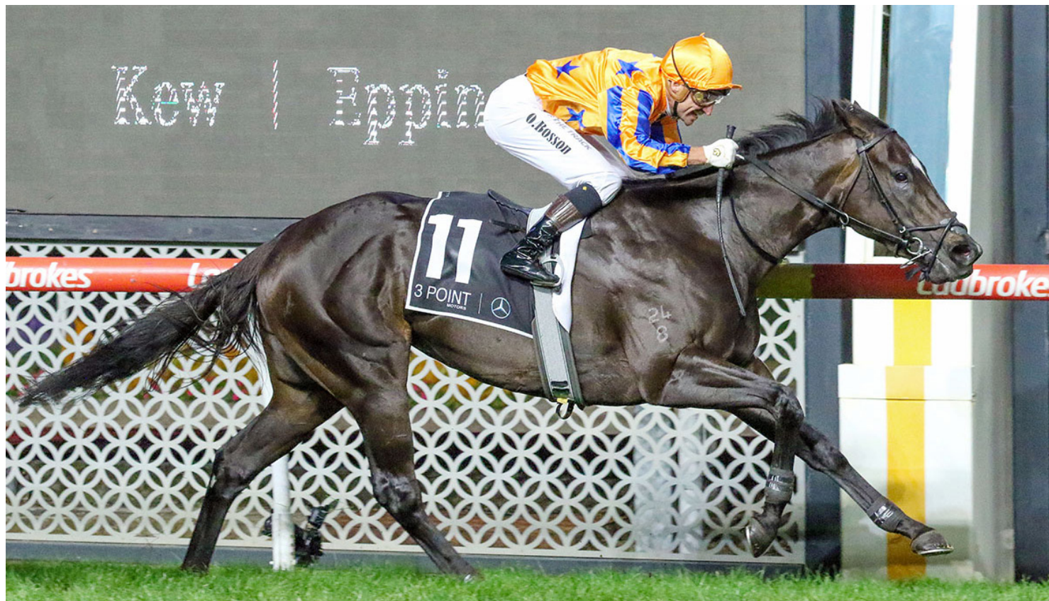
Imperatriz has been crowned 2023-24 New Zealand Thoroughbred Horse of the Year.

G irl power reigned supreme at the 2024 New Zealand Thoroughbred Horse of the Year awards in Hamilton on Sunday.