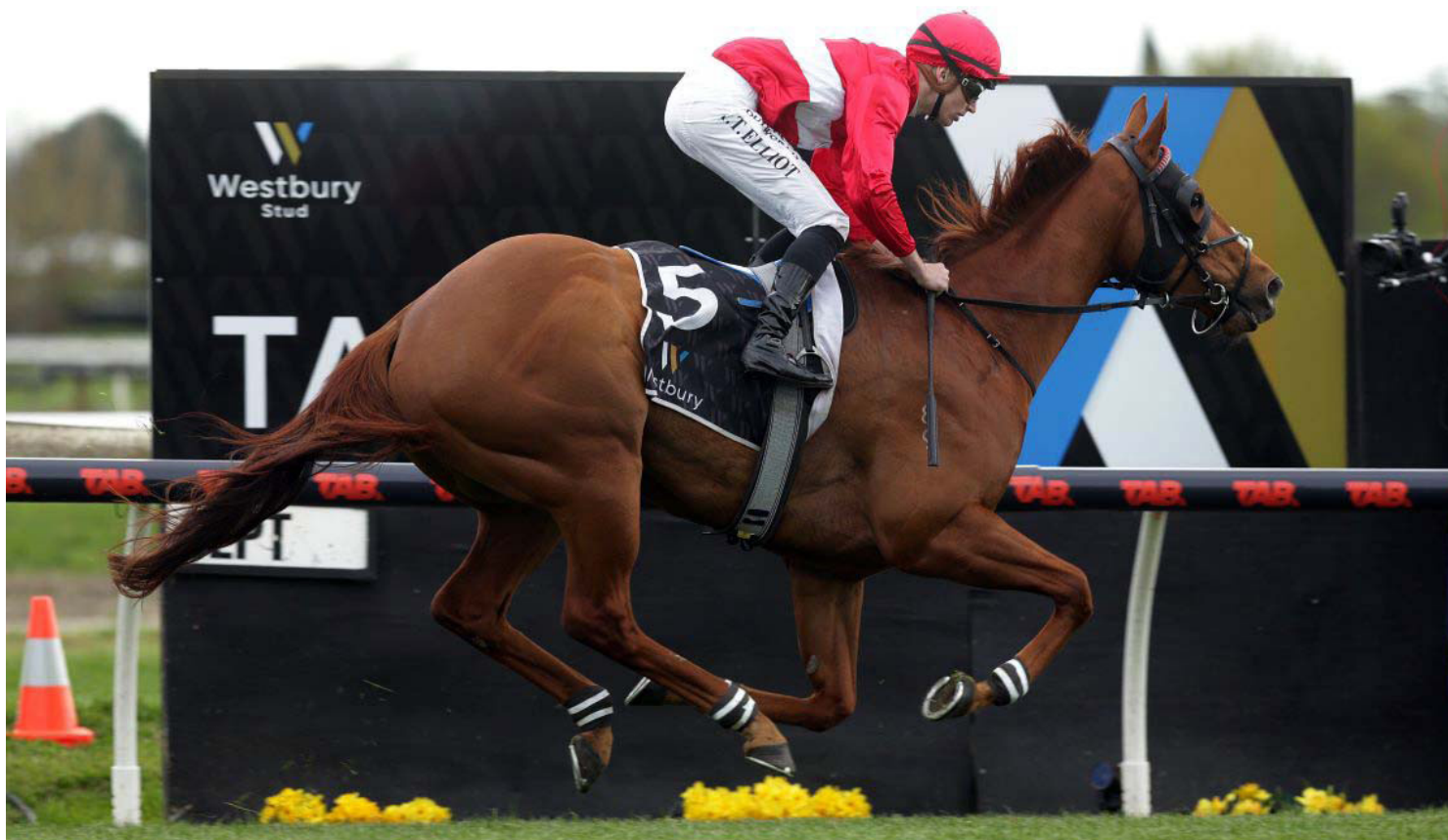
Navigator winning the Vet Services Equine Hawke's Bay Premier (1200m) at Hastings on Saturday.

P rogressive sprinter Navigator (NZ) (El Roca) produced one of the standout performances of the meeting at Hastings on Saturday, continuing his formidable fresh-up record in the Vet Services Equine Hawke's Bay Premier (1200m).