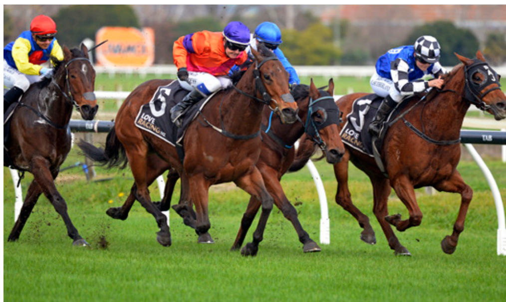
Spencer (orange silks) prevailed in a thrilling finish to the Taradale Club Handicap (1200m) at Hastings on Saturday.