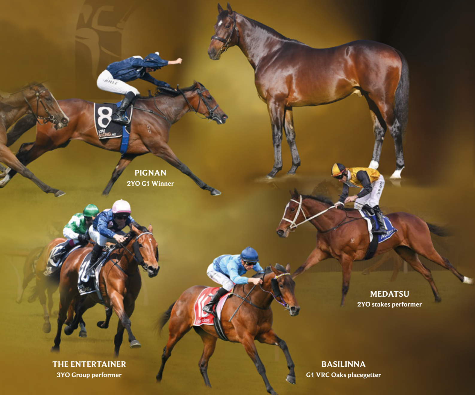
PIGNAN 2YO G1 Winner

ONE OF NEW ZEALAND'S MOST EXCITING YOUNG SIRE WITH MULTIPLE STAKES HORSES FROM HIS FIRST CROP