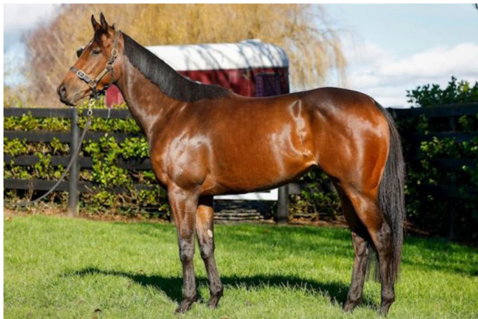
Blue-blood filly Full Tilt is Lot 12 in the 2024 National Online Breeding Stock Sale which is now Live on Gavelhouse Plus.