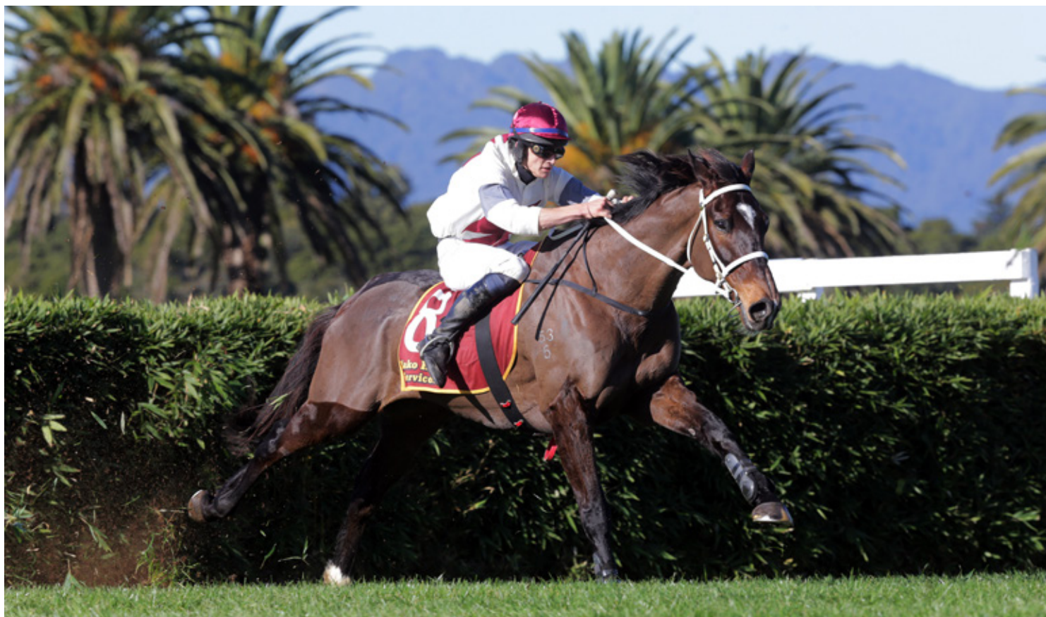
Sound Of Silence clears a fence on the way to victory at Te Aroha on Thursday.