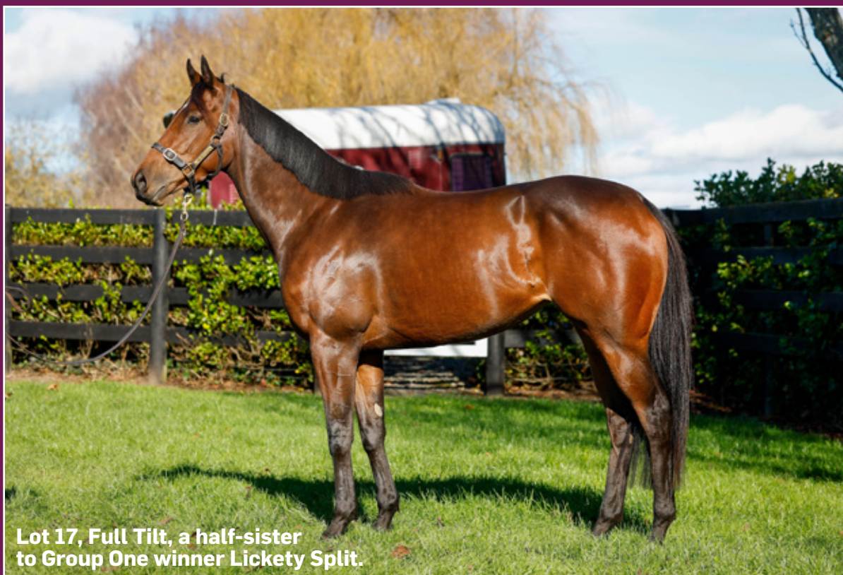
Lot 17, Full Tilt, a half-sister to Group One winner Lickety Split.

Featuring 58 Lots including quality off the track fillies and mares plus mares in foal to the likes of Ace High, Armory, Circus Maximus, Contributor, Embellish, Eminent, Ghibellines, Ocean Emperor, Per Incanto, Profondo, Proisir, Reliable Man, Satono Aladdin, Staphanos, Sweynesse, Sword of State, The Bold One, The Chosen One, Time Test, Tivaci, Turn Me Loose, Vadamos, War Decree and What's the Story.