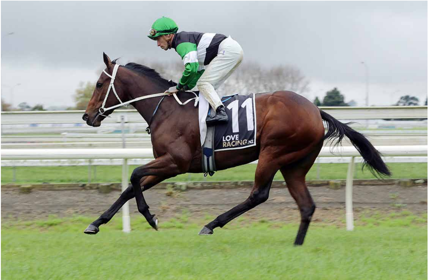
Loch Katrine heads to the start before taking out the Listed Staphanos At Novara Park Champagne Stakes (1600m)

L ightly raced filly Loch Katrine (NZ) (Ardrossan) lived up to her breeding when she scampered through the heavy conditions at Pukekohe to break her maiden status in the Listed Staphanos at Novara Park Champagne Stakes (1600m).