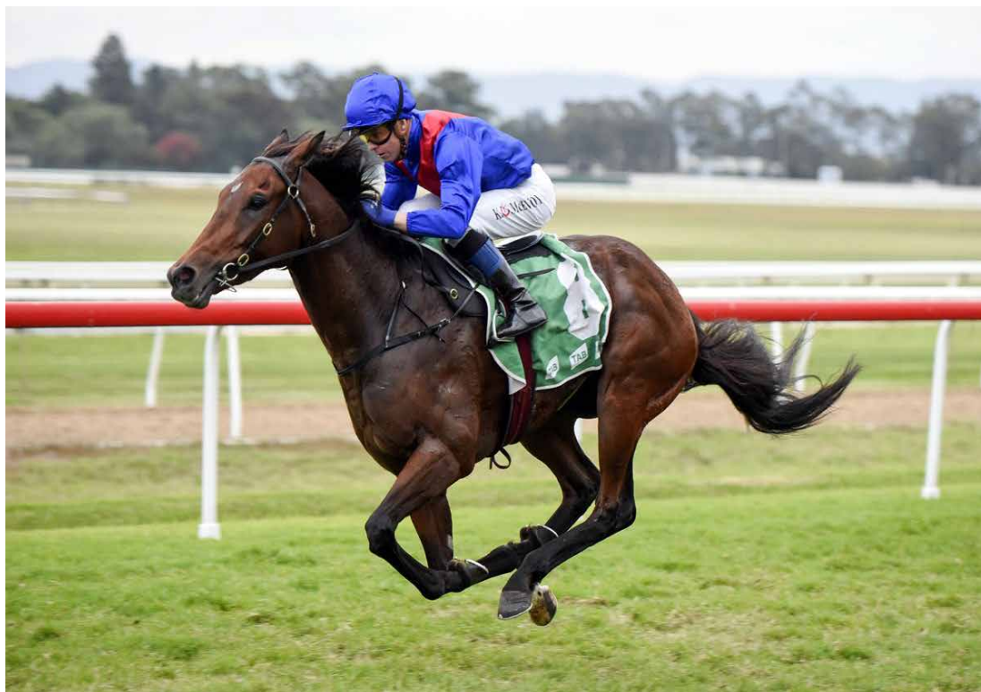
Palmetto dashes clear to win at Hawkesbury