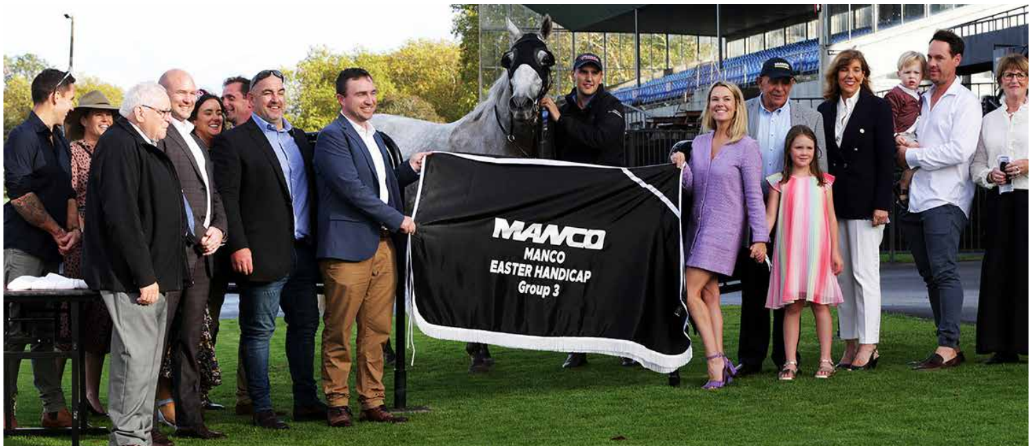
Sponsors and connections pose with White Noise after his win at Pukekohe