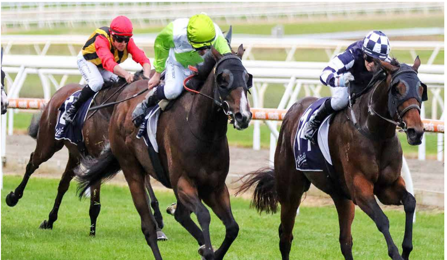
Maracana (inside) took out the last of the day at Mornington.