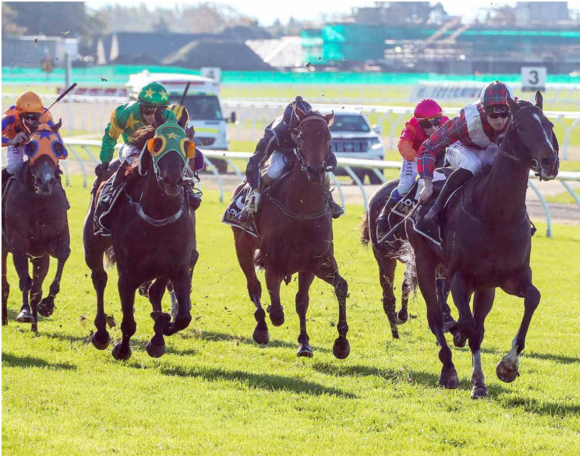
Times Ticking is clear in the Gr.3 Coca Cola Canterbury Gold Cup (2000m)

scoffing the lot so he looks like he will pull up pretty good from the race."