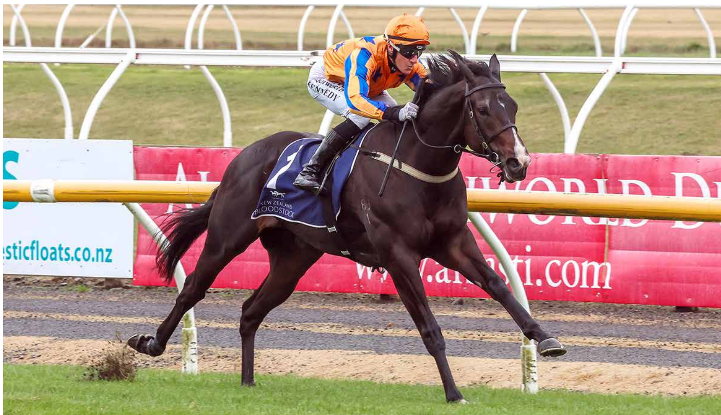
Nucleozor dominates his rivals to claim the Listed Riccarton Park Function Centre Welcome Stakes (1000m) on Saturday.

The Listed Riccarton Park Function Centre Welcome Stakes (1000m) has been moved to a new position on the South Island's racing calendar, but its first autumn running at Riccarton on Saturday brought no change to Te Akau Racing's dominance of the two-year-old feature.