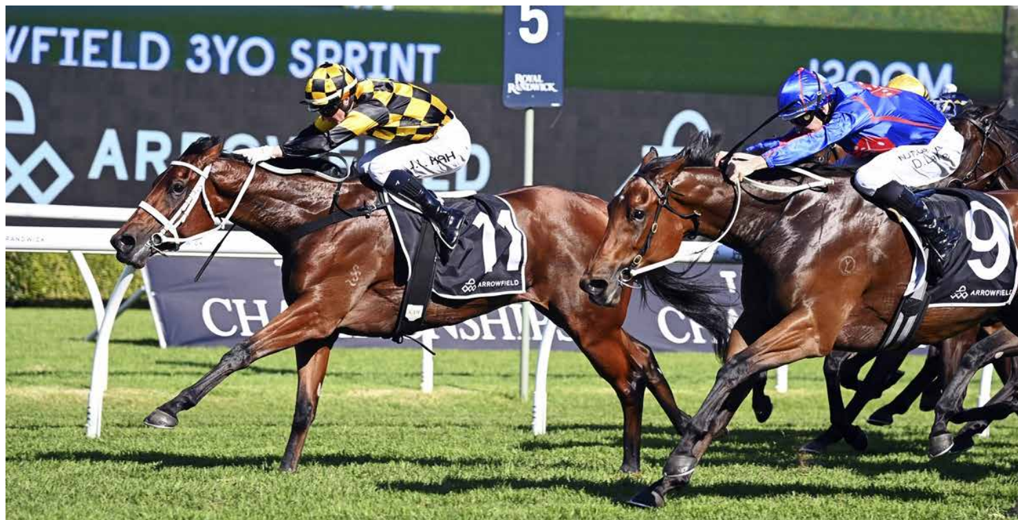
Joliestar wins the Gr.2 Arrowfield 3YO Sprint (1200m) at Royal Randwick.