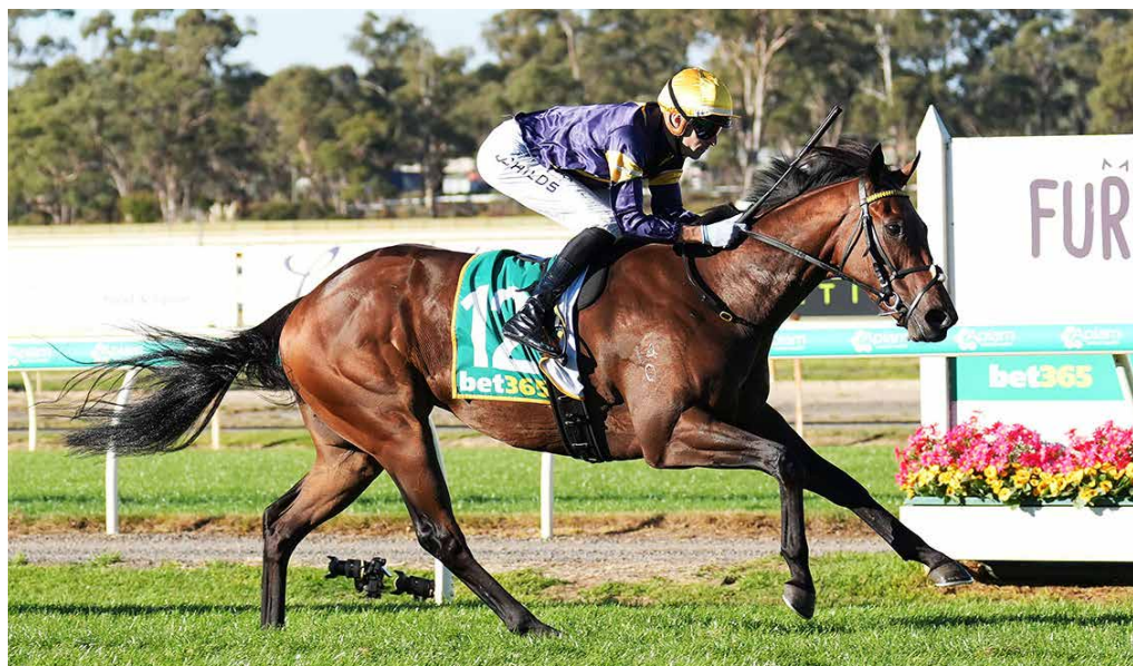
War Machine eases to victory in the Listed Bendigo Guineas (1400m) on Saturday.

"This time in, he's just kept improving, His work on the track