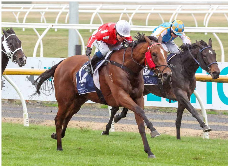
Epee Beel wins the Listed NZB Insurance Stakes (1600m) on Saturday.