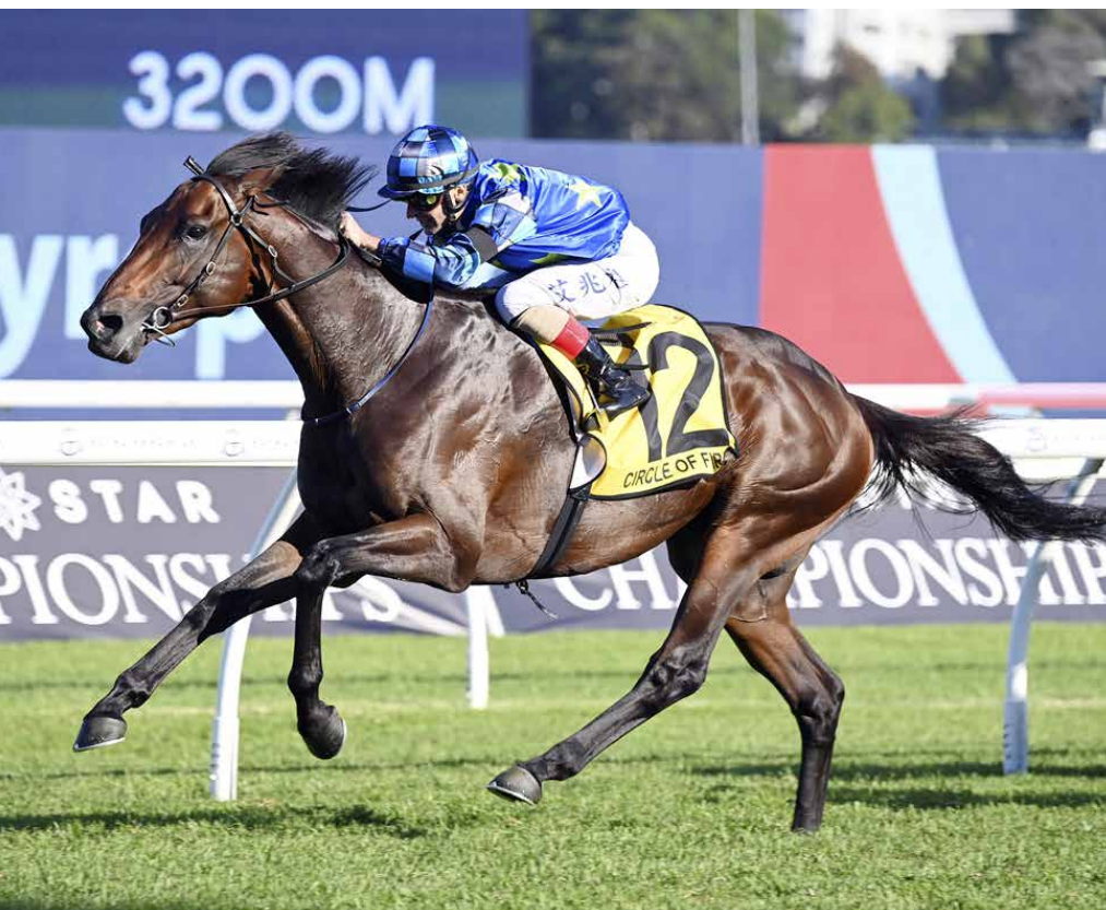
Circle Of Fire claims top honours in the Gr.1 Sydney Cup (3200m).