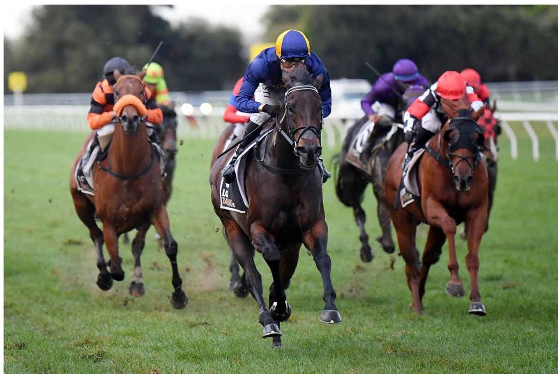
Imwonderfultonight cruises to victory in the Listed City Of Napier Sprint (1200m) at Otaki on Saturday.