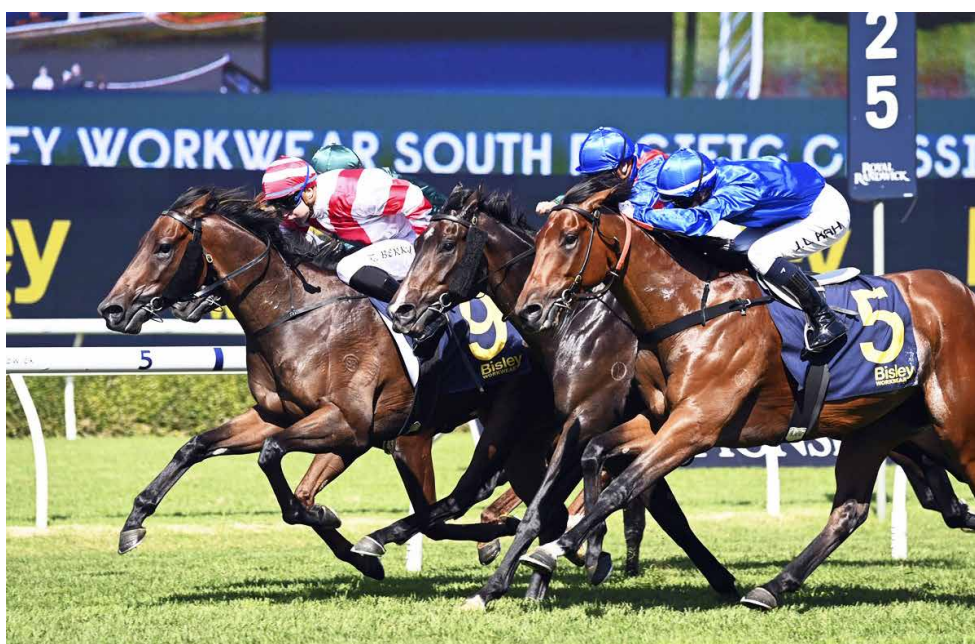
Panic scores a narrow victory in the Listed South Pacific Classic (1400m) at Randwick on Saturday.