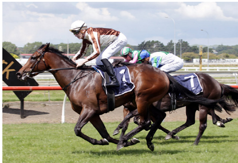
Legarto completes an amazing victory in the Gr.2 ATR Eight Carat Classic (1600m)

"Every time I asked her, she kept finding lengths and she