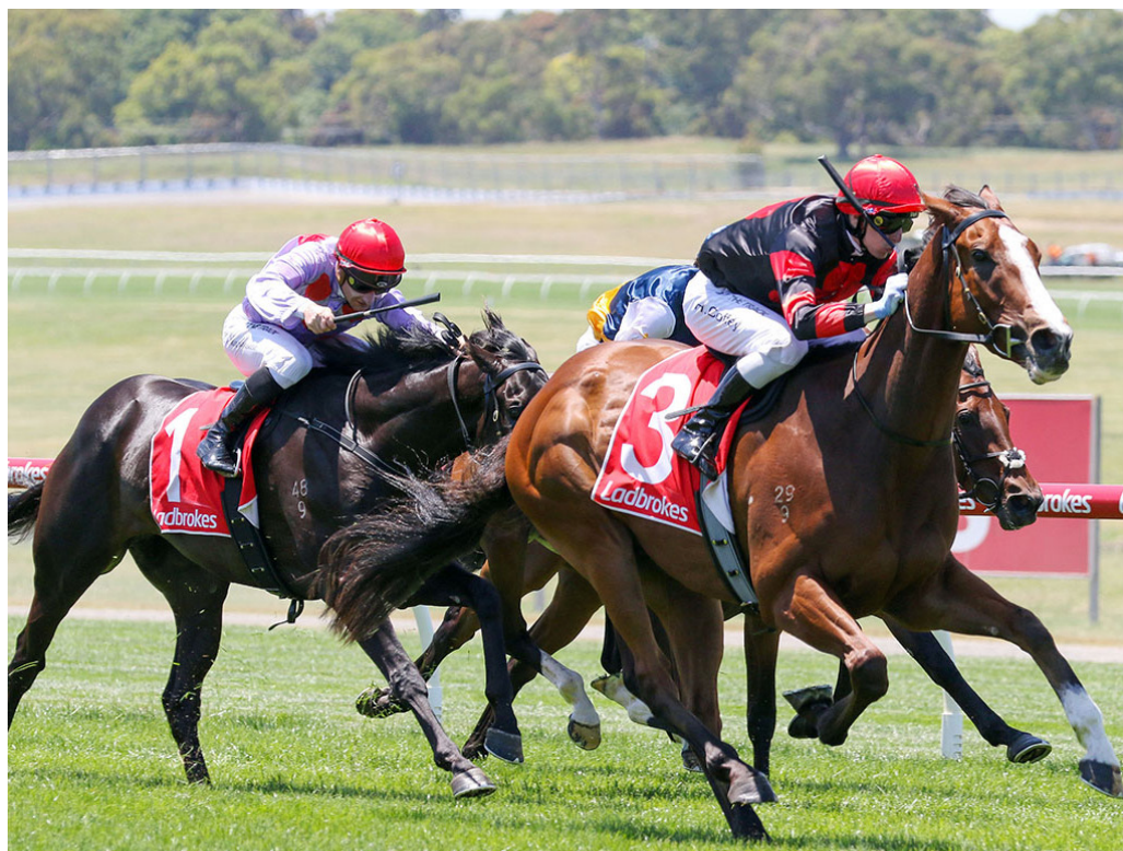
Promising galloper Dunkel wins comfortably at Sandown