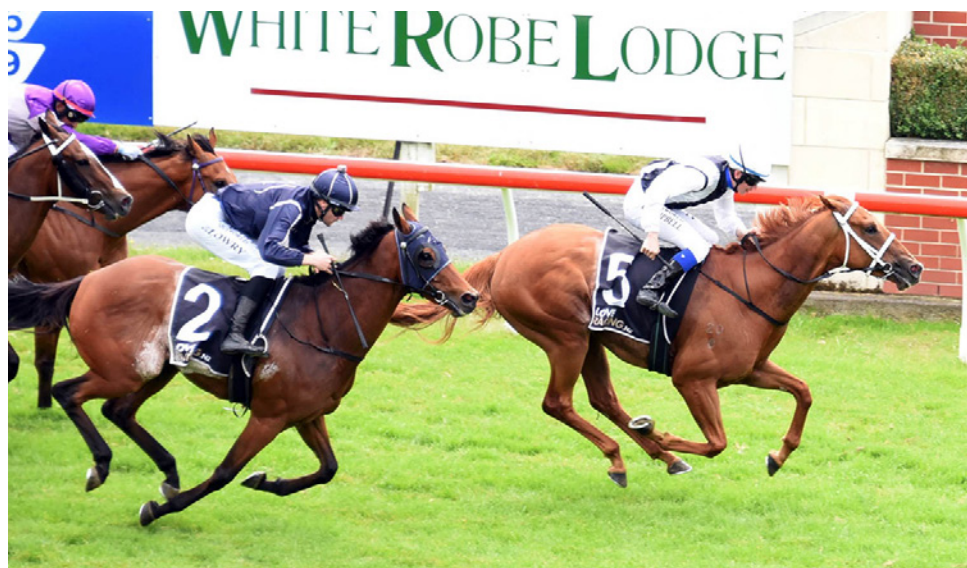
Buoyant stamps his class with victory in the Listed Property Brokers Hazlett Stakes (1200m)

Now there could be even bigger and better things in store, including a potential shot at the Gr.1 Newmarket Handicap (1200m) on March 11. The time-honoured Flemington feature