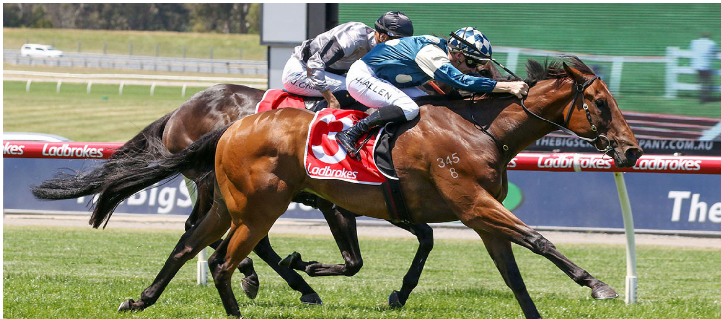
St Lawrence keeps his winning streak intact with a victory at Sandown