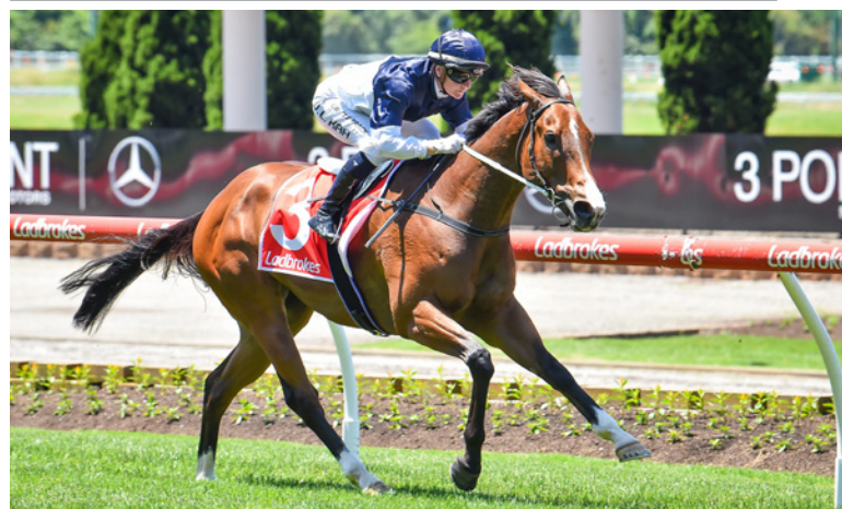
Inundation smashes the track record at The Valley.