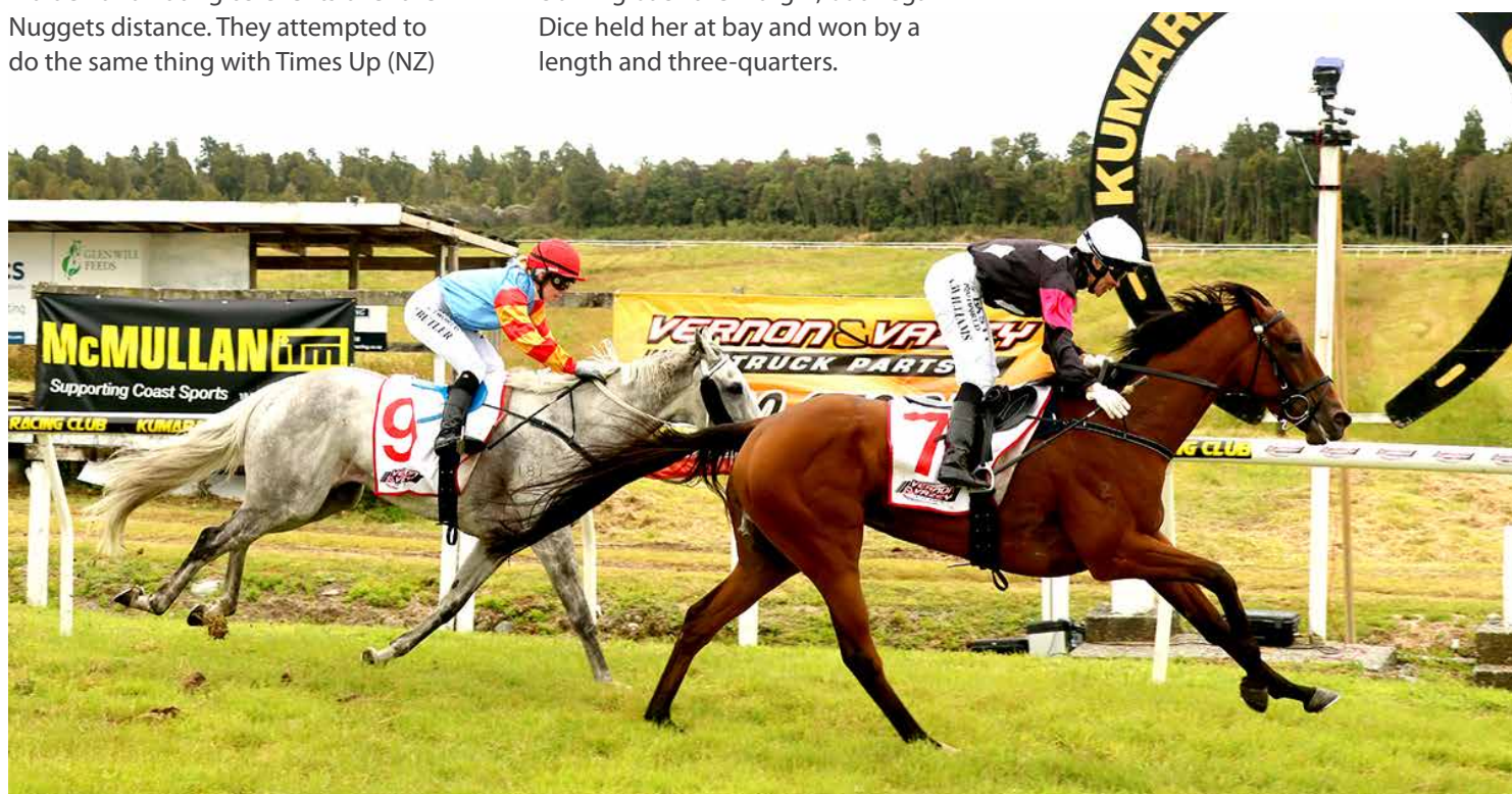
Northern visitor Regal Dice reigns supreme in the iconic Vernon & Vazey Truck Parts Kumara Gold Nuggets (1810m) on Saturday.