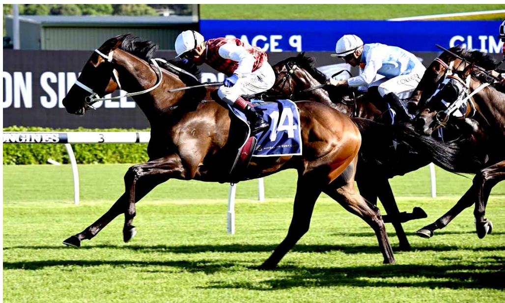
Lyrical Gangster strides clear of his rivals to win at Randwick on Saturday.