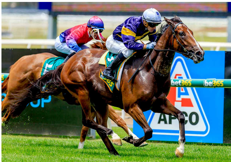
Carbonados remains unbeaten after scoring in his Australian debut at Geelong.