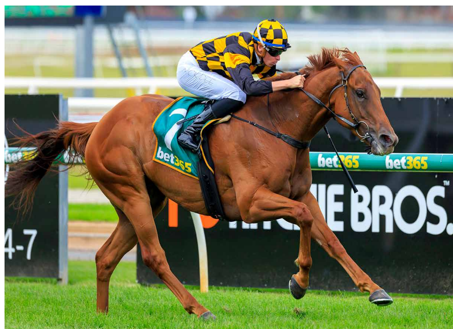
Holymanz justified his race favourite status with a win in the Coastal Classic at Geelong on Saturday.