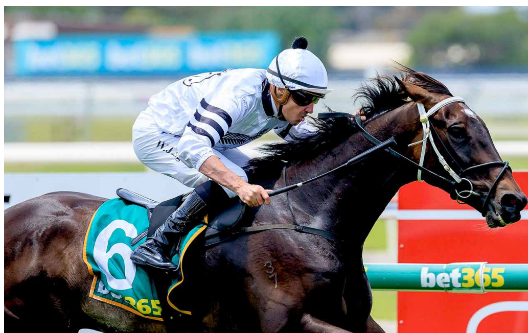
Wertheimer caught punters by surprise when winning at Geelong on Saturday.