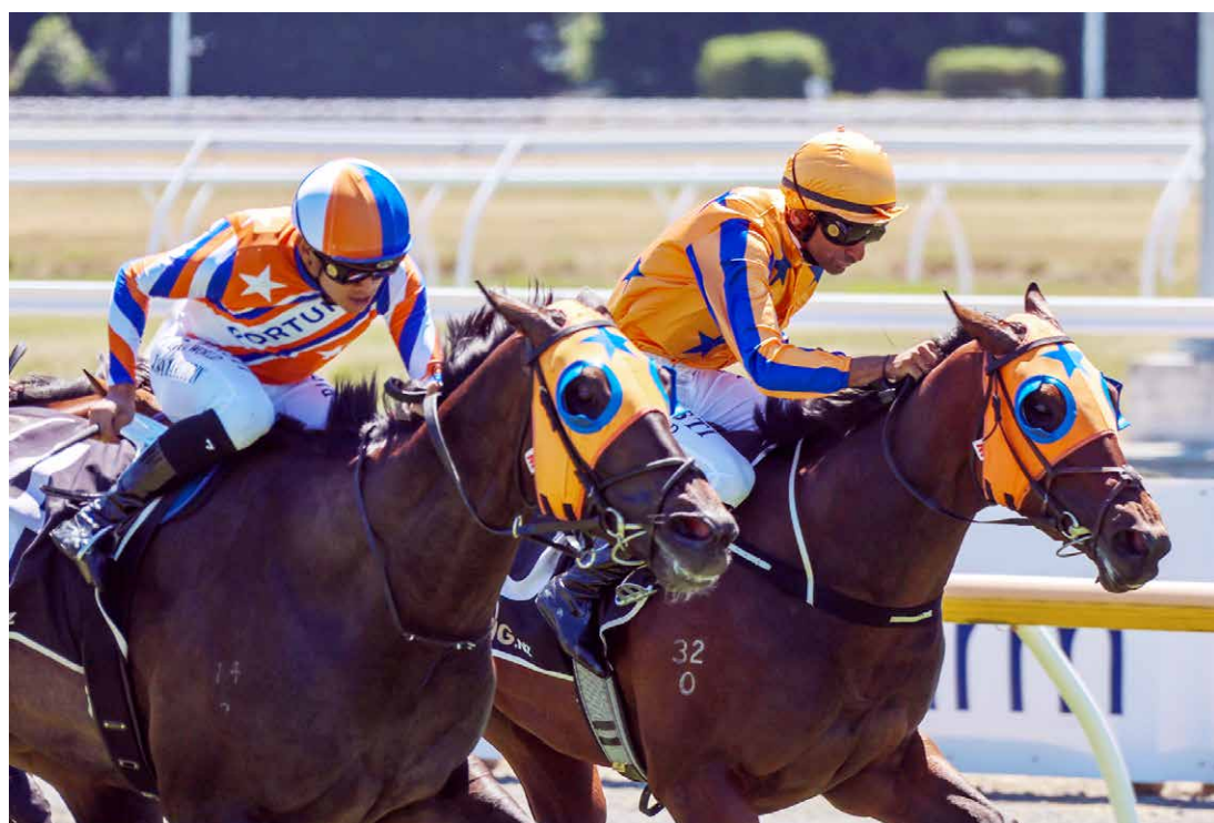
Te Akau stablemates Angel Wings (outer) and Superbly Written fight out the finish in the Berkley Stud At Karaka 2024 (1100m).