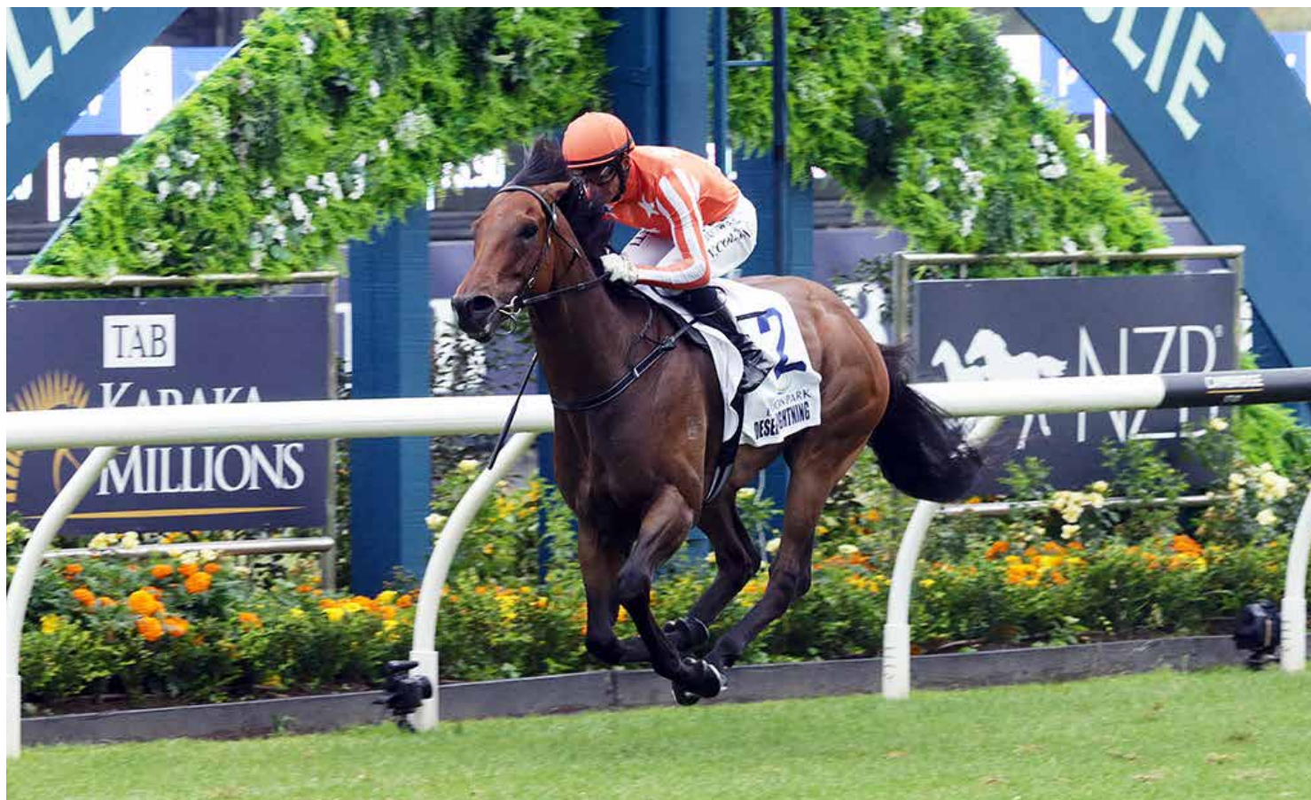
Desert Lightning rises to an emphatic victory in the inaugural $1 million Elsdon Park Aotearoa Classic (1200m) at Ellerslie.

Desert Lightning (NZ) (Pride Of Dubai) has spent the majority of his career flying under the radar, but there was no denying his place at the top of the tree in the inaugural $1 million Elsdon Park Aotearoa Classic (1600m) at Ellerslie on Saturday.