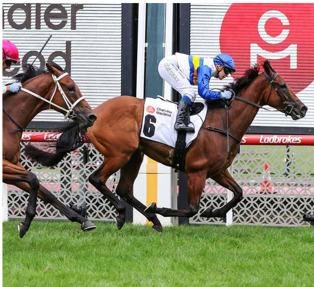
Akrotiri headed home a New Zealand-bred trifecta in the A$130,000 Chandler Macleod Handicap (2040m) at The Valley.