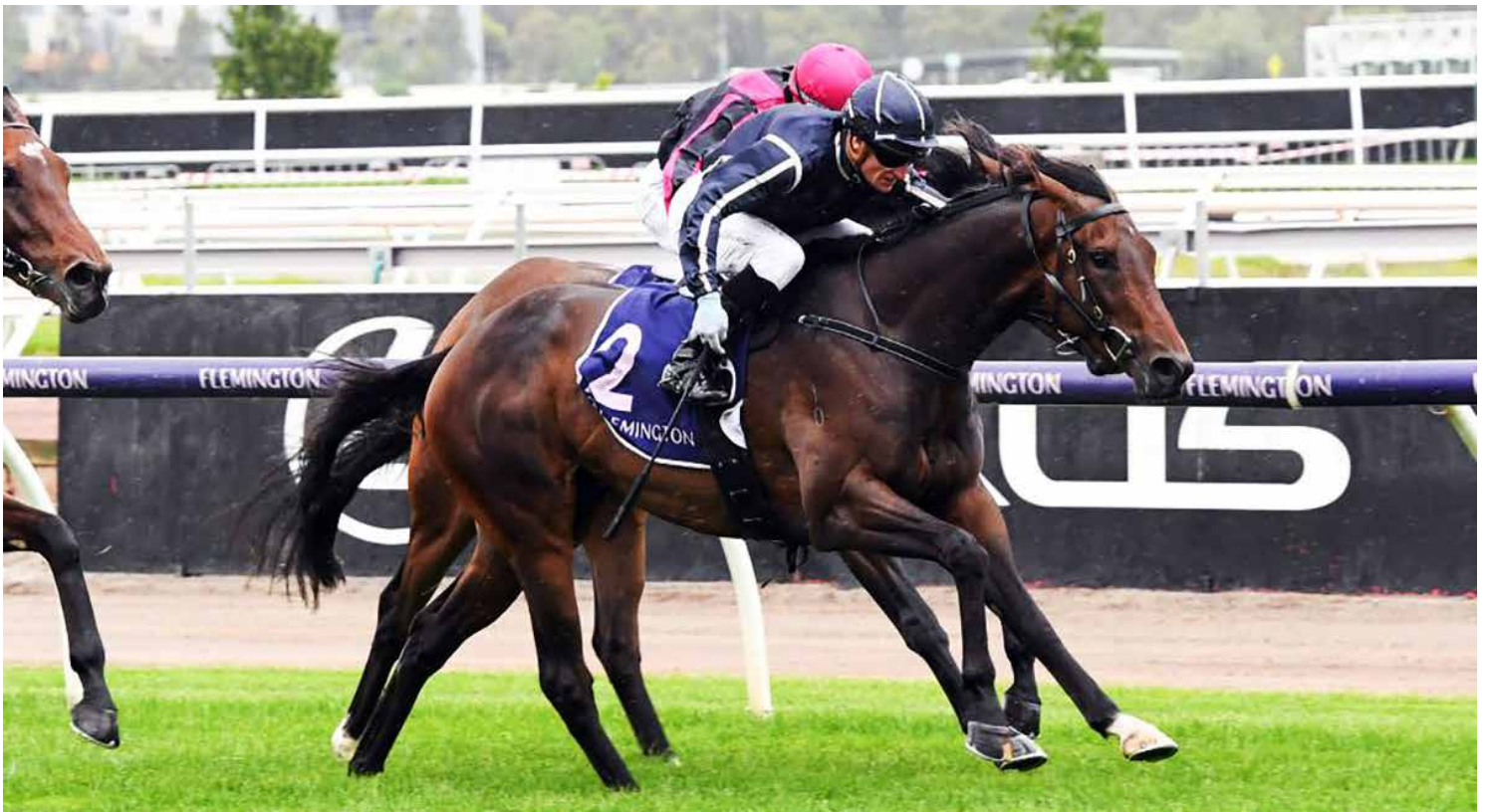
Bold Soul was brilliant taking out the Listed Kevin Sharkie Launceston Guineas (2100m).