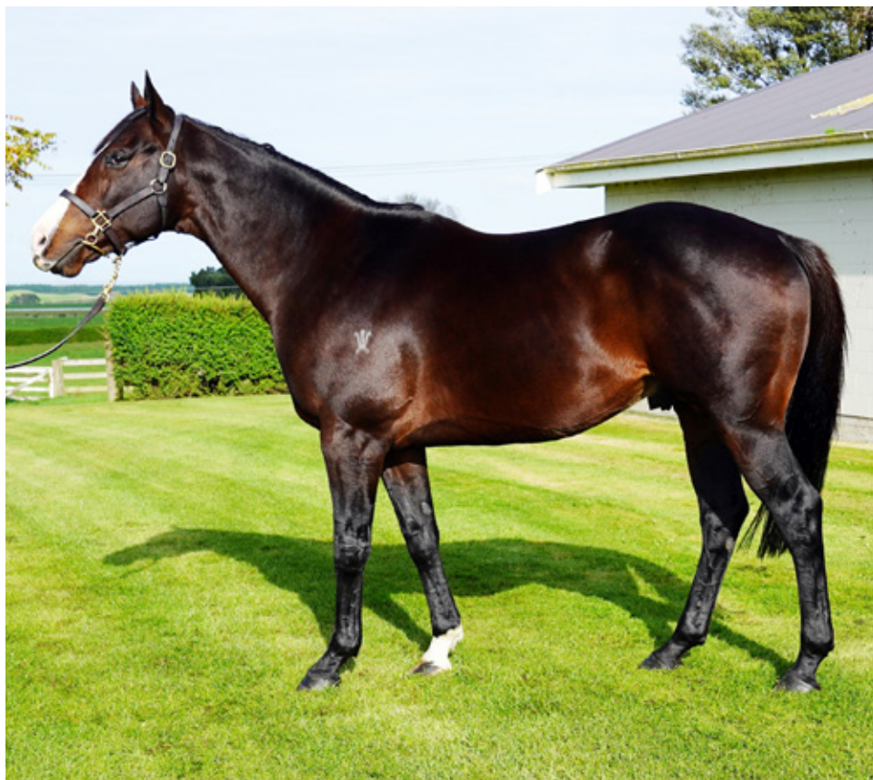
The Bold One at Grangewilliam Stud