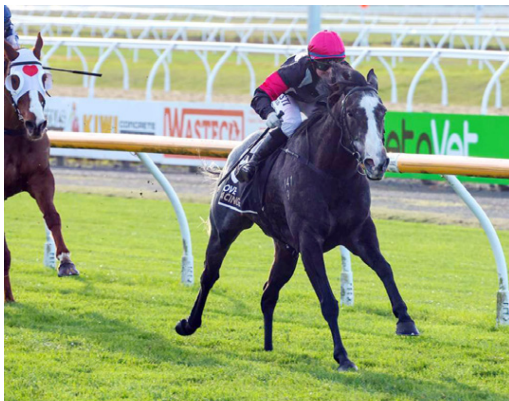
Catherinenz winning at Riccarton Park on Saturday.