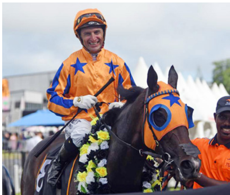
Te Akau Racing mare Campionessa winning the Gr.1 Zabeel Classic (2050m) in December.

"Of those we only have $1 million in shares left to sell as our existing owners have been incredibly supportive plus we have a large number of first-time investors in the stable.