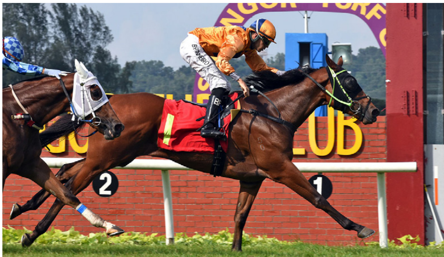
Antipodean stretched his unbeaten run to six after winning in the 3YO Pacific Cup (1200m) at Selangor on Sunday.