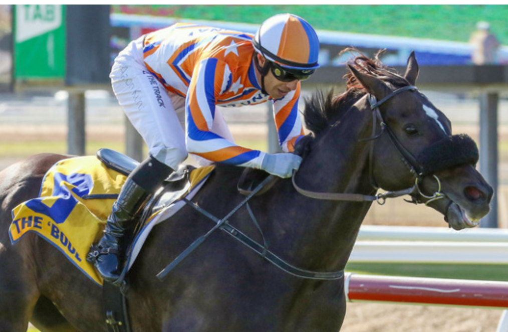
Leaderboard winning during the Warrnambool May Carnival.