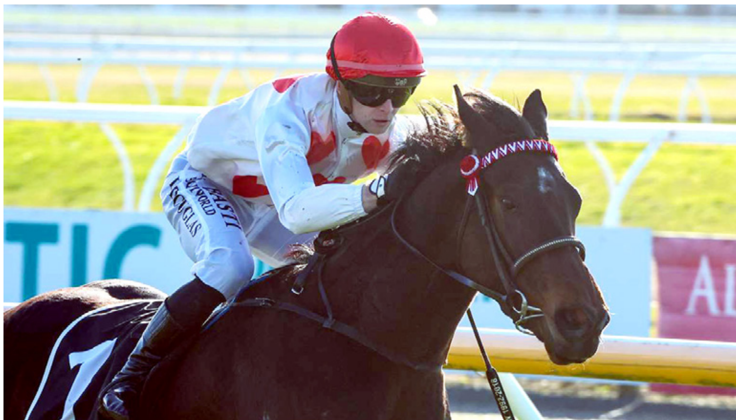
Imptee winning at Riccarton last Saturday.