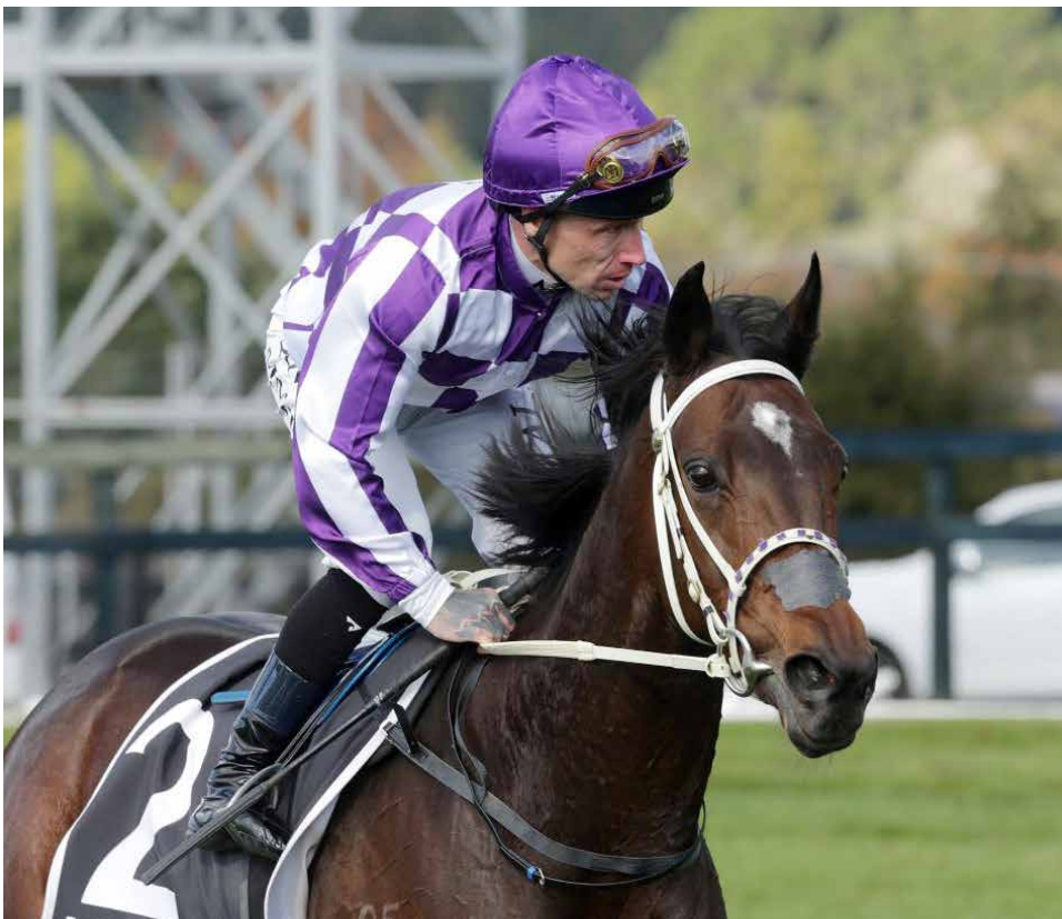
Casino Princess winning at Arawa Park on Saturday.