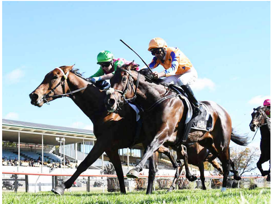
Joshua Brown (outside) winning at Arawa Park last Saturday.