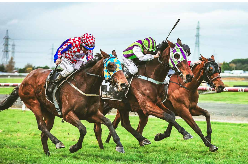
Loftys Gift (outside) winning the Wairio Cup (2200m) on Sunday.