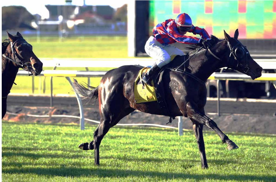
Orlov winning at New Plymouth on Saturday.

"That could be his last run in this campaign although we