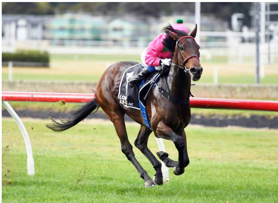
First Gear powers away to win the the TAB Odds Surge Every Race at Trentham 2YO (1200m).