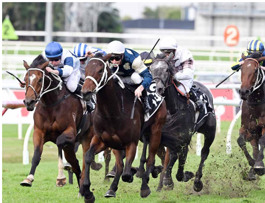
Scarlet Oak (white cap) winning the Gr.2 The Roses (2000m) at Doomben on Saturday.

Scarlet Oak was originally destined to be sold at New Zealand Bloodstock's National Yearling Sale but luck of the draw, or bad luck in this case, resulted in her being withdrawn.