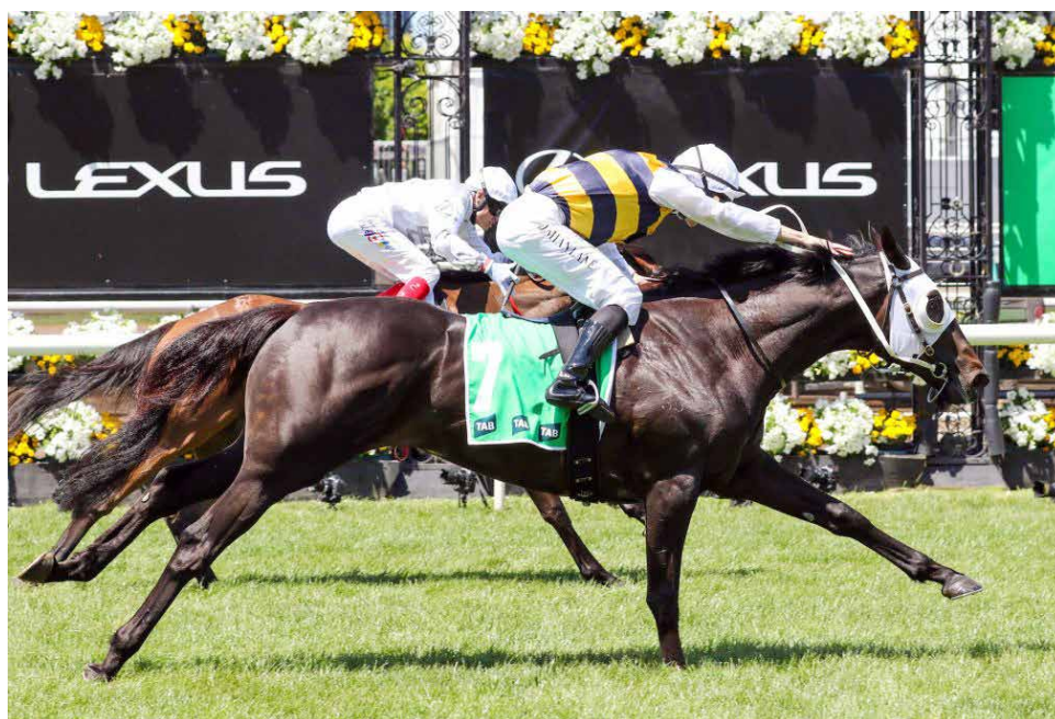
Warmonger will contest Saturday's Gr.1 Queensland Derby (2400m) at Eagle Farm.