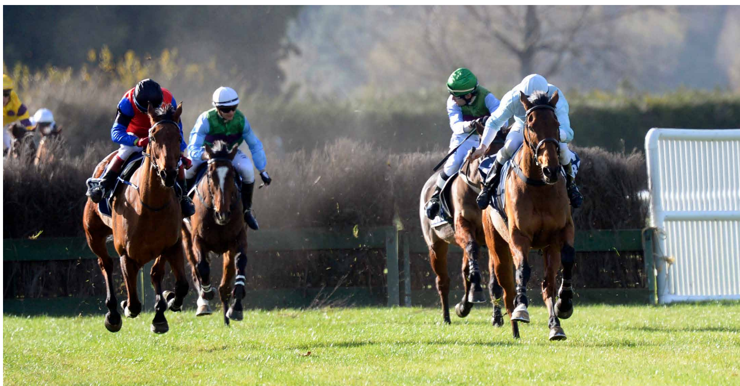
West Coast (inside) outsprints a game Izmydaad to win the L J Hooker Manawatu Steeplechase (4000m) at Woodville on Sunday.