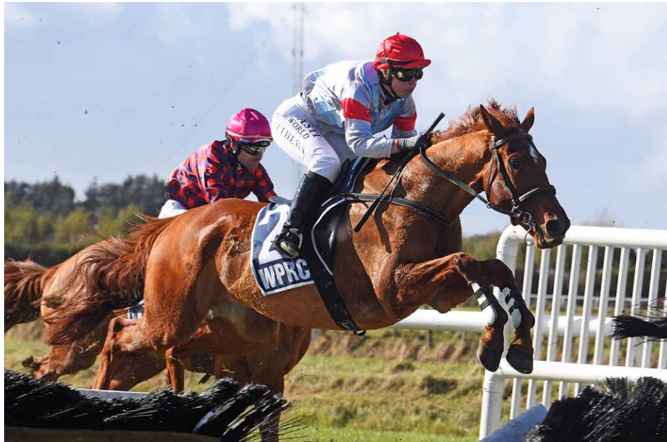
Berry The Cash on his way to a dominant victory in the Manawatu ITM Awapuni Hurdle (3000m) at Woodville.