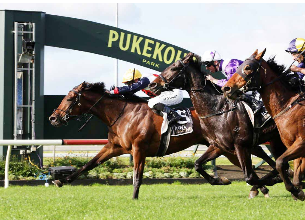
Devastate winning at Pukekohe on Saturday.