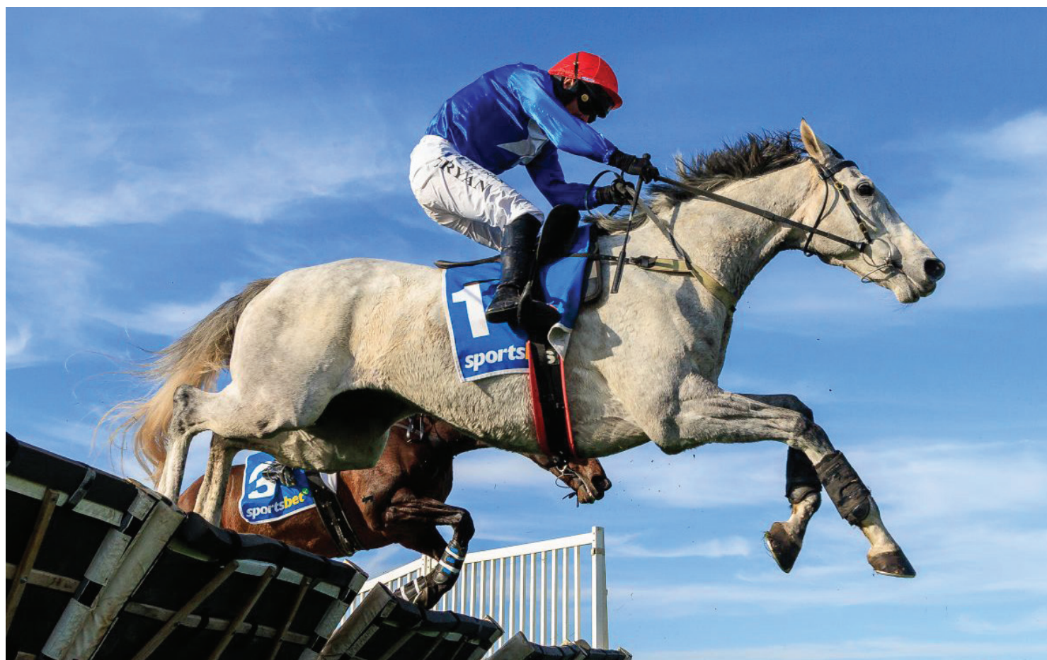
The Cunning Fox remained unbeaten over hurdles in the Australian Hurdle at Sandown on Sunday. (Grant Courtney)