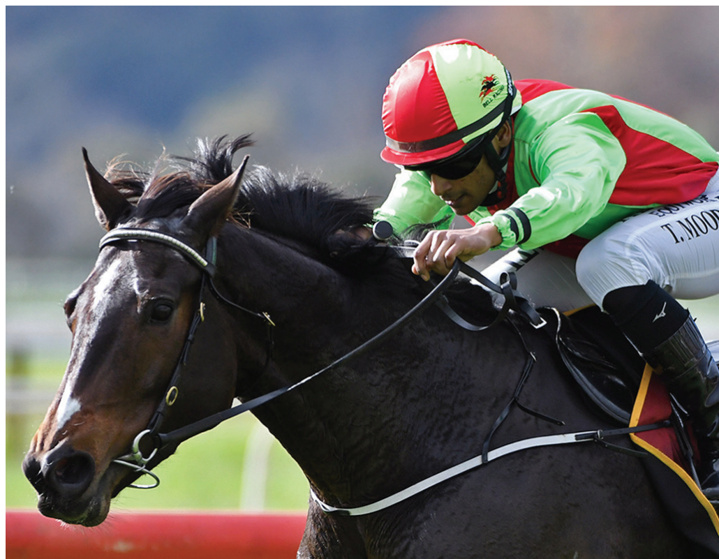
Twain winning at Te Aroha on Monday.