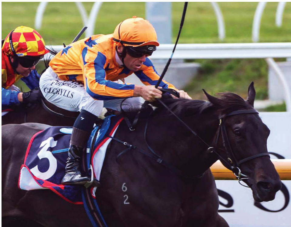
Cool Aza Rene won the Nellies Restaurant and Bar 2YO (820m) at Wingatui on Sunday.